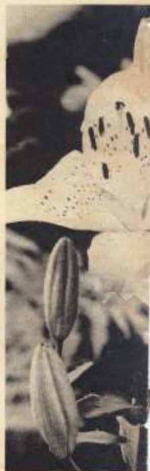
Above: Harmony, a Mid-Century Hybrid variety, bright orange.

These bulbs, by the way, look delightful growing near to the bright blue Delphinium, the rich blue of the latter enhancing the pure white of the Lily.