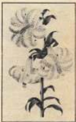
Below: The Crimson-anthered Lily, Lilium azovitsianum , an old-world favourite.