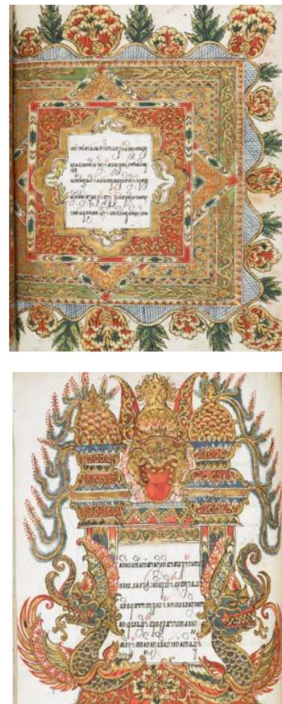
FIGURE 2. Illumination page 31r – floral figure (above) & page 41v – scale motif (below)

The process of selecting figures in the illuminations has been selected based on the suitability of the shape for Yogyakarta's written batik. There are 4 figures, namely a peacock, a plant and its tendrils, as well as a scale-like motif. All of these figures are composed so that they are suitable for making batik motifs. The motifs are made manually and then digitized to facilitate the process of transferring them to the fabric which will go through the canting process (figure 3). The process of making a manual sketch is an important stage because it not only tries to find the right composition but indirectly provides a "bond" between the writer and the motif. It provides more imagination and memory about related cultures. This assertion is in line with Pallasmaa's phenomenological concept, that when someone is involved in manually sketching something, it will provide a strong experience