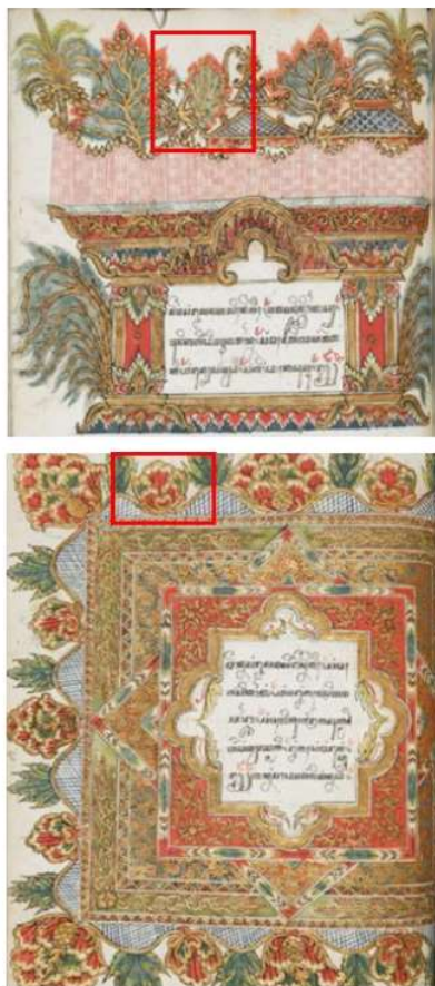
FIGURE 1. Illumination page 22v – peacock figure (above) & page 30v – floral figure (below)

There are certain motifs from several Serat JLW