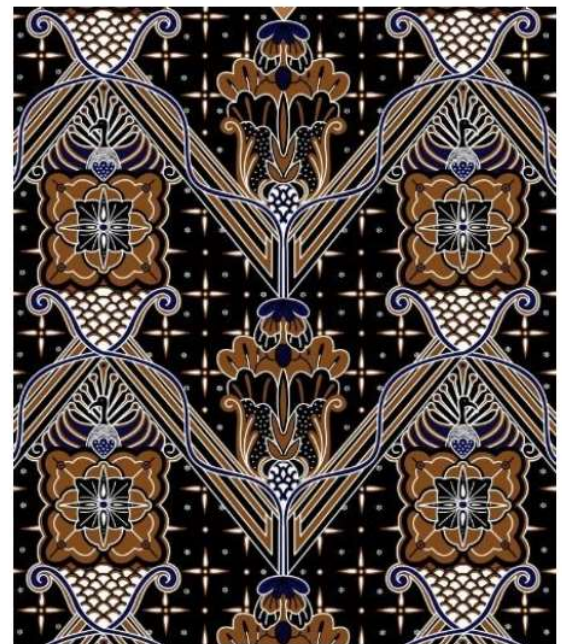
FIGURE 4. Consultation with local batik artisans (above) & batik motif with colour (below)