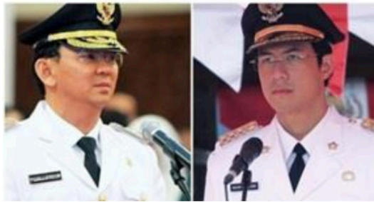
Figure 7. The real Ahok (left) and Daniel Mananta as Ahok (right) in the official uniform (Prasetyo, 2018)

From the cinematography point of view, the film mostly uses close-up shots to create a close distance between the audience and the main characters, especially Ahok, so that the audience can understand why Ahok whom they know becomes what he is today. The dialogue, costumes, and set are designed realistically. The main characters speak in the local dialect and wear costumes that fit the period of the film which spans about 15-20 years from the moment Ahok was a kid to the moment when he became the governor of Jakarta. All these details help create the atmosphere that draws the audience to experience the journey of a Chinese-Indonesian political figure who rises to the top due to his commitment to helping the needy and the poor as a government official. Regarding the timing of the film production that is during the campaign period for the position of Jakarta governor which is smeared by identity politics, Ahok states that the film has a risk of being rejected or worse, causing demonstrations from those who think that Ahok has committed blasphemy. But the fact that the film is watched by over one million audiences in its first thirty days of screening suggests otherwise.