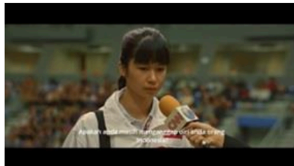
Figure 8. Susi Susanti in one of the interviews when asked if she still considers herself an Indonesian.

Susi Susanti: Love All is a biopic based on the life of one of the legendary Indonesian badminton players, Susi Susanti. This is the first popular film that depicts an ethnic Chinese female athlete. Indeed, there are not many Indonesian biopic films on athletes, and based on the data, only 4 other such films are produced in the 21st century that cover athletes from various sports: badminton, football, archery, and speed climbing. Susi Susanti: Love All tells the story of Susi's life, starting from the time she is given a chance to join a talent scouting program in Jakarta up until she decides to retire in 1998. The film highlights Susanti's career and achievements as an Olympic gold medalist while also depicting the unfair treatment she (and her fellow Indonesian players and coaches of Chinese descent) received during Soeharto's regime. They are ethnically discriminated against and even denied their Indonesian citizenship despite their contribution to Indonesia as athletes (Figure 8).