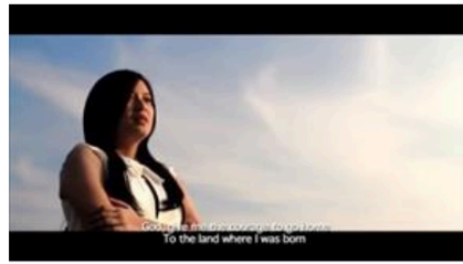
Figure 3. Fang Yin finally decides to return to her homeland