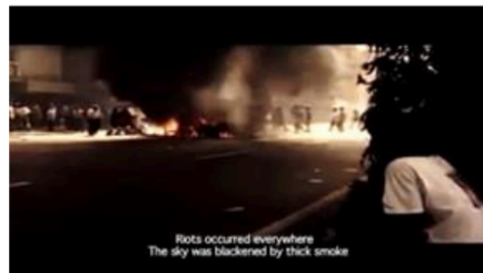
Figure 2. Found footage of the 1998 riot used in the film

The scene is accompanied by a voice-over of a narrator informing the audience about who Fang Yin is. The scene then suddenly changes into a bright sky of Jakarta, where the audience can see Fang Yin doing social work educating street children. She is seen to be an optimist, cheerful and sociable person. Then the tone changes again when the film gets into the event of 1998. Some found footage of the events is inserted into the film to add a realistic feeling of what happened (Figure 2).