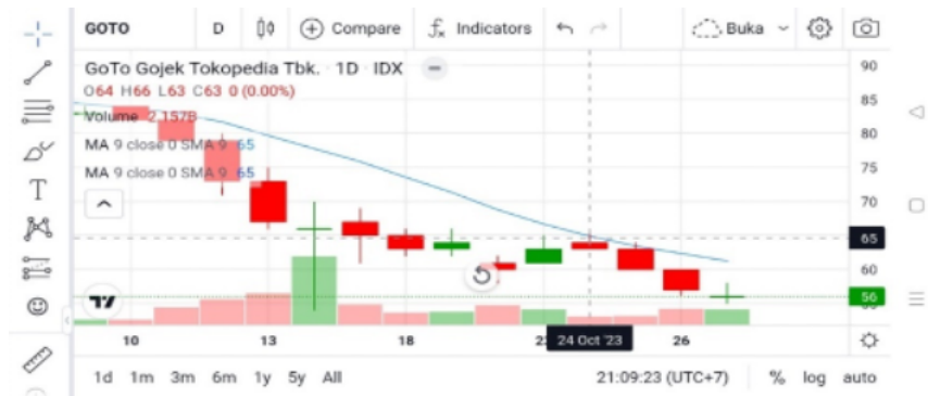
Figure 4. Technical analysis GOTO.