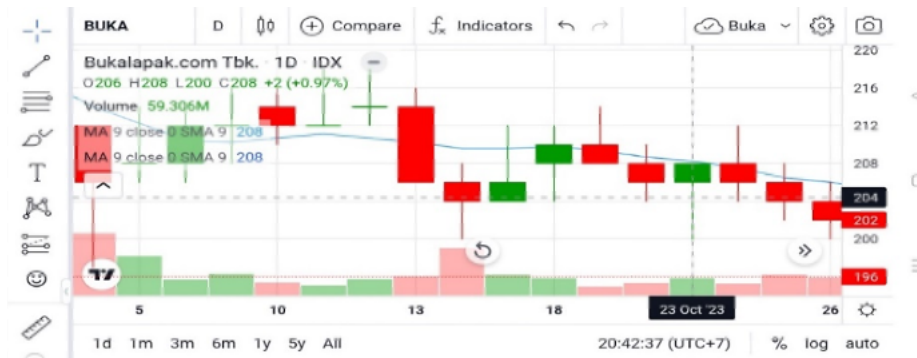
Figure 1. Technical analysis BUKA.