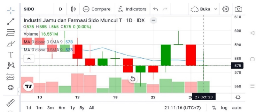
Figure 8. Technical Analysis SIDO.

On October 25, 2023, EMTK's share price is at 555. On that date, there was a purchase of EMTK stock which was at a price of 555.