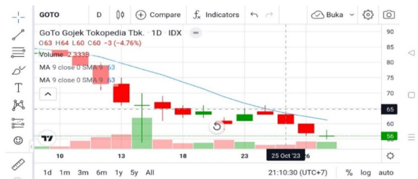
Figure 6. Technical Analysis GOTO.

On October 24, 2023, GOTO's stock price will be at 65. On October 24, 2023, there was a sale in GOTO stock at a price of 64. It suffered a loss on GOTO stock of 100.