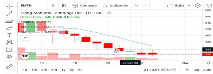
Figure 7. Technical Analysis EMTK.