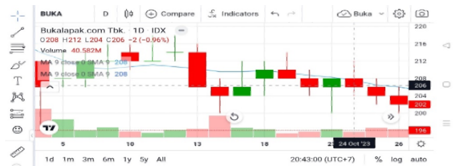
Figure 2. Technical analysis BUKA.

On October 23, 2023, the purchase price of BUKA stock is 204. On October 23, there was a purchase of shares that were priced at 206. At $206, the stock grew by 0.97%.