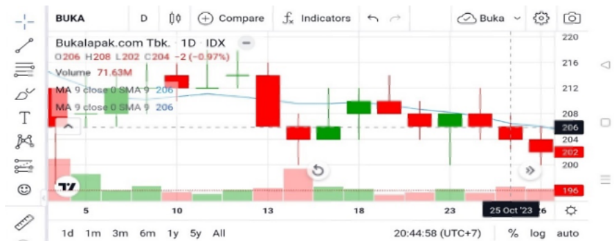
Figure 3. Technical analysis BUKA.

On October 24, 2023, there was a sale of shares at a share price of 206. When the sale of shares is carried out on October 24, 2023, it can earn a profit of 200.