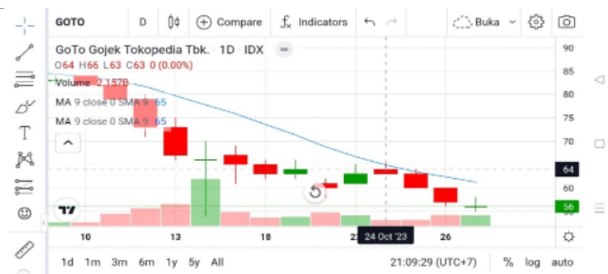
Figure 5. Technical Analysis GOTO.

On October 24, 2023, the share price in GOTO will be at 65. On October 24, 2023, there was a purchase of GOTO stock at a price of 65.