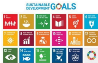
Figure 1: Sustainable Development Goals (SDGs)

reinforced by worldwide leaders in a consensual way. This indicated the beginning of a new universal elaboration program starting from January 1, 2016, aimed at attaining seventeen sustainable development goals for the year 2030 (refer to figure 1). [1].