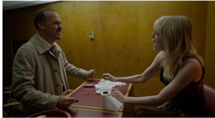
Figure 7. The two-shot shows them opposing each other (00:39:23). (Iñárritu, 2014)

concerned about how Sam will ruin his Broadway play if she comes back to rehab because Sam works as an assistant in Riggan's play. This conflict is visually shown on the following screenshots: