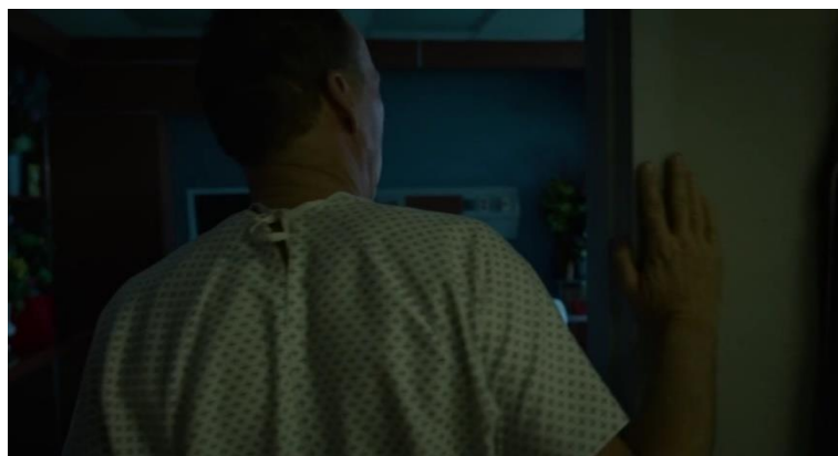
Figure 4. Riggan leaves the bathroom (1:50:02). (Iñárritu, 2014)

The screenshots above show the event when Riggan is hospitalized after his failed suicide attempt. Riggan goes to the bathroom and finds his delusion of Birdman sitting on the toilet (see Figure 3). It suggests that the Birdman figure is about to be "flushed away" just like the waste. Riggan finally succeeds to detach himself from his past. The framing shows that Riggan's position is higher and bigger than the Birdman. It emphasizes that his present self is more dominant than his past as Birdman. It is further supported by Riggan's saying "bye-bye and fuck you" (1:50:14) to the Birdman figure when he leaves the bathroom without looking back (Figure 4). His gesture emphasizes his determination to move on, as well as underlying the solution to his internal conflict. Sartre's theory that says a person will not be anything until he makes something of himself supports Riggan's eagerness to make a successful Broadway play. Only known as Birdman makes Riggan feel that his life is meaningless. Producing a Broadway play is Riggan's way to make his life meaningful or defined. He wants to be recognized as who he is and by his own.