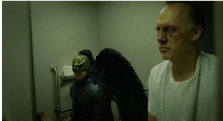
Figure 3. Riggan and his delusion of Birdman in the bathroom (1:50:02). (Iñárritu, 2014)

The internal conflict is resolved when Riggan's play unexpectedly turns out to be a success. People praise him and his play receives good reviews. As Riggan's producer states, "I can see the future. This play is gonna last forever. It's gonna be in London and Paris. And the studio's gonna call again, we're gonna get some books deals" (1:45:46 – 1:45:54). His delusional Birdman figure no longer speaks to him. The resolution of this conflict is visually shown in the screenshots below: