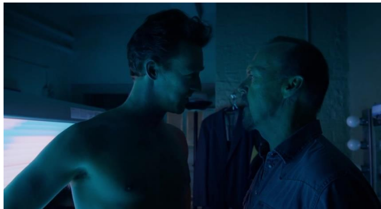
Figure 5. Two-shot of Riggan and Mike, showing Riggan's dominance by being put on the right (00:56:24). (Iñárritu, 2014)

On the other hand, Mike disrespects Riggan because he thinks Riggan does not deserve to be responsible for the play. He also does not want to be under Riggan's control. Mike replies to Riggan by saying, "Your stage? Let me tell you something. This stage has belonged to a lot of great actors, but you're not one of them, pal . . . Nobody? My massive hard-on got 50.000 views on Youtube . . . Why don't you get your wings and your fucking bird suit, man?!" (00:56:23 – 00:58:05). Mike disrespects Riggan by saying that Riggan does not belong to the Broadway stage since he is not a great actor and should go back to portray Birdman. He also brags about how he is already famous and that he can do whatever he likes.