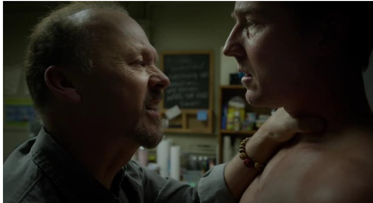
Figure 6. Mike becomes more dominant by being put on the right side (00:57:15). (Iñárritu, 2014)

The relation between the visuals of the conflict and Sartre's theory can be seen from how Riggan has to slightly look up whenever he is arguing with Mike (see Figures 5 and 6). It suggests that Riggan's life is nothing or meaningless compared to Mike's, who is famous as a theatre actor. Sartre says that someone exists and then defines himself afterward. In this conflict, Mike's life is already defined, and he is maintaining it, and the way Riggan has to look up signifies Riggan's effort to achieve a similar position as Mike, who is defined by his talent in acting. Sartre's theory that says someone will not be anything until he makes something with his actions and efforts also supports the cause of Riggan's anger in the conflict which is to make his life meaningful. The fact he is only famous for portraying a superhero in blockbuster films makes Riggan think that his life is nothing or meaningless. To make his life defined or meaningful, Riggan must change people's opinions about him that he is not just Birdman and capable of doing something greater than that. So Riggan worries that if Mike Shiner draws more attention from the people, his efforts in making the Broadway play will be overshadowed by Mike's popularity, and his attempt to make his meaningful will fail.