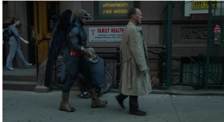
Figure 1. Wide shot of Riggan walks on the street followed by the Birdman figure (1:28:58) (Iñárritu, 2014)

The Birdman figure represents Riggan's past which is emphasized by its position behind Riggan. It is following Riggan as a hint that it affects Riggan's present self. The internal conflict is made obvious visually by splitting Riggan's character into two, himself now and himself in the past. The wide-shot type is usually used for establishing the subject's relationship to the environment and elements within it. The use of a wide shot is meant to emphasize that people around Riggan are not aware of the Birdman figure's presence, and it proves that the Birdman is only in his mind.