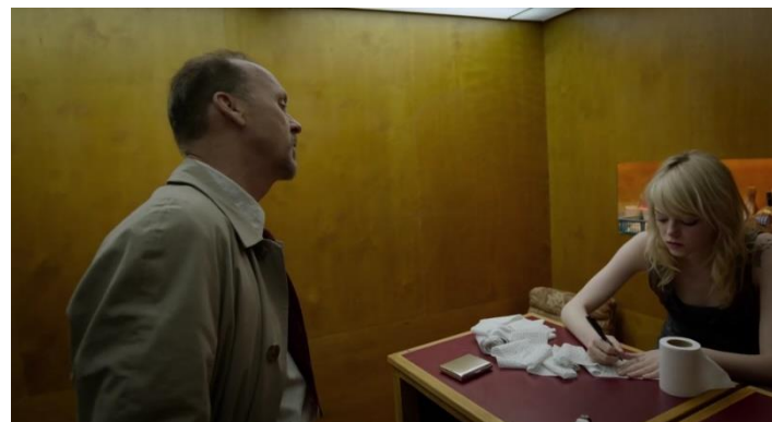
Figure 9. Sam with some crumpled toilet paper (00:38:52). (Iñárritu, 2014)

The conflict starts with a two-shot type to emphasize two opposing forces: Riggan and Sam (Figure 7). Later, the shot changes to a close-up shot of Sam who is angry with Riggan (Figure 8). The relation between the visuals of this conflict with Sartre's theory can be seen from the way the scene uses low-key lighting to create a strong contrast between images. The low-key lighting supports the notion that Riggan has not been able to fully define his existence. Some parts of him have not been "exposed", and