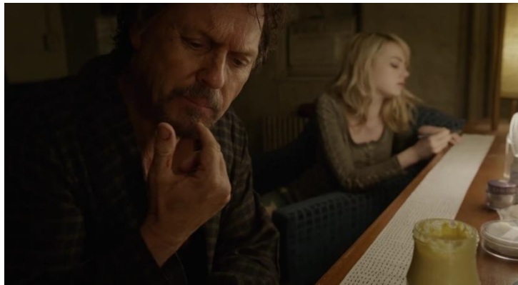
Figure 10. The Toilet paper lays out neatly on the table (01:19:08). (Iñárritu, 2014)

This conflict is resolved when Riggan apologizes to Sam for not being a good father when he says, "I was a shitty father, wasn't I?" to which Sam calmly replies, "No, you were fine." Then after that, Sam continues talking about how Riggan's play becomes viral on the internet, which suggests that Sam becomes supportive of Riggan's play (1:19:29 – 1:20:30). The resolution is visually shown in the following screenshot: