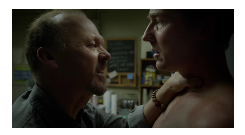
Figure 6. Mike becomes more dominant by being put on the right side (00:57:15). (Iñárritu, 2014)

The relation between the visuals of the conflict and Sartre's theory can be seen from how Riggan has to slightly look up whenever he is arguing with Mike (see Figures 5 and 6). It suggests that Riggan's life is nothing or meaningless compared to Mike's, who is famous as a theatre actor. Sartre says that someone exists and then defines himself afterward. In this conflict, Mike's life is already defined, and he is maintaining it, and the way Riggan has to look up signifies Riggan's effort to achieve a similar position as Mike, who is defined by his talent in acting. Sartre's theory that says someone will not be anything until he makes something with his actions and efforts also supports the cause of Riggan's anger in the conflict which is to make his life meaningful. The fact he is only famous for portraying a superhero in blockbuster films makes Riggan think that his life is nothing or meaningless. To make his life defined or meaningful, Riggan must change people's opinions about him that he is not just Birdman and capable of doing something greater than that. So Riggan worries that if Mike Shiner draws more attention from the people, his efforts in making the Broadway play will be overshadowed by Mike's popularity, and his attempt to make his meaningful will fail.