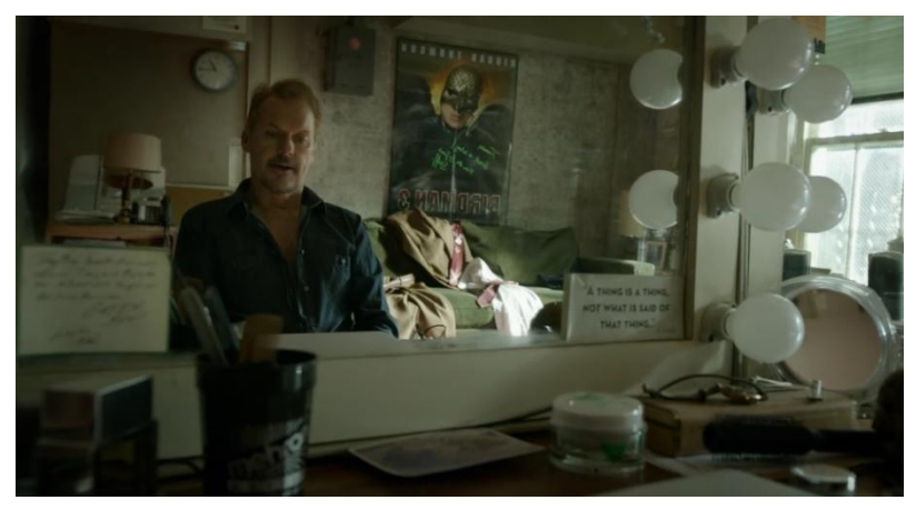
Figure 3. Riggan and his delusion of Birdman in the bathroom (1:50:02). Birdman (Iñárritu, 2014)

The internal conflict is resolved when Riggan's play unexpectedly turns out to be a success. People praise him and his play receives good reviews. As Riggan's producer states that, "I can see the future. This play is gonna last forever. It's gonna be in London and Paris. And the studio's gonna call again, we're gonna get some books deals" (1:45:46 - 1:45:54). His delusional Birdman figure no longer speaks to him. The resolution of this conflict is visually shown in the screenshots below: