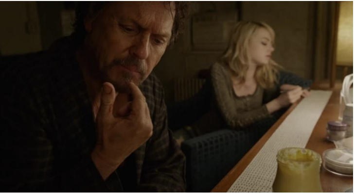
Figure 10. The Toilet paper lays out neatly on the table (01:19:08).

This conflict is resolved when Riggan apologizes to Sam for not being a good father when he says, "I was a shitty father, wasn't I?" to which Sam calmly replies, "No, you were fine." Then after that, Sam continues talking about how Riggan's play becomes viral on the internet, which suggests that Sam becomes supportive of Riggan's play (1:19:29 - 1:20:30). The resolution is visually shown in the following screenshot: