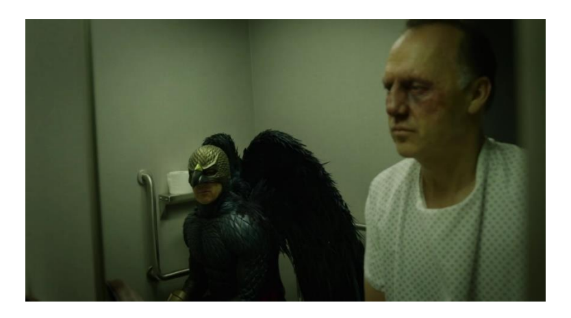
Figure 3. Riggan and his delusion of Birdman in the bathroom (1:50:02). (Iñárritu, 2014)

The internal conflict is resolved when Riggan's play unexpectedly turns out to be a success. People praise him and his play receives good reviews. As Riggan's producer states, "I can see the future. This play is gonna last forever. It's gonna be in London and Paris. And the studio's gonna call again, we're gonna get some books deals" (1:45:46 – 1:45:54). His delusional Birdman figure no longer speaks to him. The resolution of this conflict is visually shown in the screenshots below: