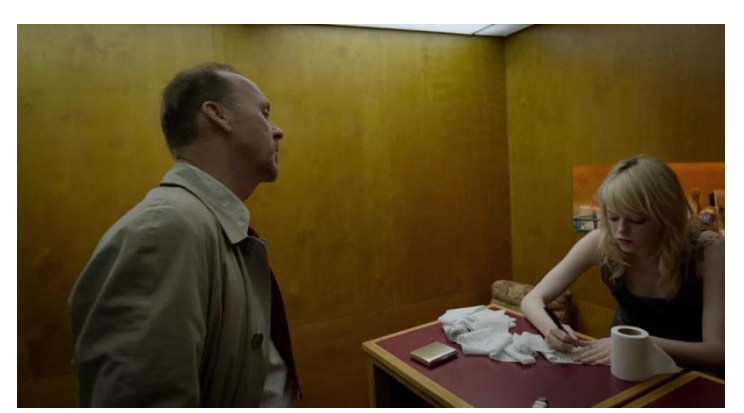
Figure 9. Sam with some crumpled toilet paper (00:38:52). Birdman (Iñárritu, 2014)

The conflict starts with a two-shot type to emphasize two opposing forces: Riggan and Sam (figure 7). Later, the shot changes to a close-up shot to Sam who is angry with Riggan (see figure 8). The relation between the visuals of this conflict with Sartre's theory can be seen from the way the scene uses low-key lighting to create strong contrast between images. The low-key lighting supports the notion that Riggan has not been able to fully define his existence. There are some parts of him that has not been "exposed", and in this case, his talent and his responsibility as a father for Sam. Sartre says that someone's life will not be anything until he makes something through his own actions and efforts. Riggan's has not been able to show people or Sam that he is able to create something with his own action and efforts and be a good father to his daughter.