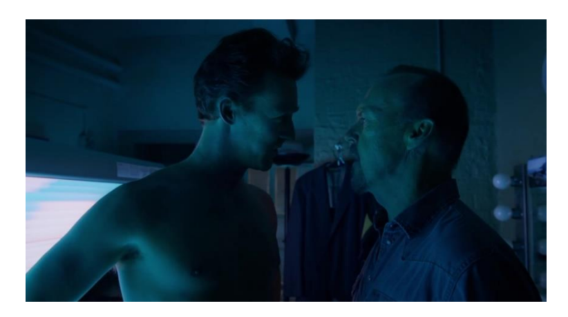
Figure 5. Two-shot of Riggan and Mike, showing Riggan's dominance by being put on the right (00:56:24). (Iñárritu, 2014)

On the other hand, Mike disrespects Riggan because he thinks Riggan does not deserve to be responsible for the play. He also does not want to be under Riggan's control. Mike replies to Riggan by saying, "Your stage? Let me tell you something. This stage has belonged to a lot of great actors, but you're not one of them, pal... Nobody? My massive hard-on got 50.000 views on Youtube... Why don't you get your wings and your fucking bird suit, man?!" (00:56:23 – 00:58:05). Mike disrespects Riggan by saying that Riggan does not belong to the Broadway stage since he is not a great actor and should go back to portray Birdman. He also brags about how he is already famous and that he can do whatever he likes.