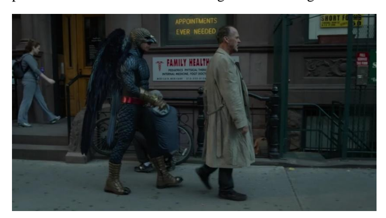
Figure 1. Wide-shot of Riggan walks on the street followed by the Birdman figure (1:28:58) Birdman (Iñárritu, 2014)

The Birdman figure represents Riggan's past which is emphasized by its position behind Riggan. It is following Riggan as a hint that it affects Riggan's present self. The internal conflict is made obvious visually by splitting Riggan's character into two, himself now and himself in the past. The wide-shot type is usually used for establishing the subject's relationship to the environment and elements within it. The use of wide shot is meant to emphasize that people around Riggan are not aware of the Birdman figure's presence and it proves that the Birdman is only in his mind.