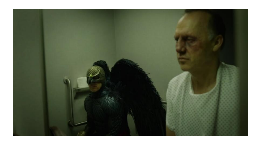
Figure 4. Riggan leaves the bathroom (1:50:02). Birdman (Iñárritu, 2014)

The screenshots above show the event when Riggan is hospitalized after his failed suicide attempt. Riggan goes to the bathroom and finds his delusion of Birdman sitting on the toilet (see figure 3). It suggests that the Birdman figure is about to be "flushed away" just like the waste. Riggan finally succeeds to detach himself from his past. The framing shows that Riggan's position is higher and bigger than the Birdman. It emphasizes that his present self is more dominant than his past as Birdman. It is further supported by Riggan's saying "bye bye and fuck you (1:50:14)" to the Birdman figure when he leaves the bathroom without looking back (figure 4). His gesture emphasizes his determination to move on, as well as underlying the solution to his internal conflict. Sartre's theory that says a person will not be anything until he makes something of himself supports Riggan's eagerness to make a successful Broadway play. Only known as Birdman makes Riggan feel that his life is meaningless. Producing a Broadway play is Riggan's way to make his life meaningful or defined. He wants to be recognized as who he really is and by his own.