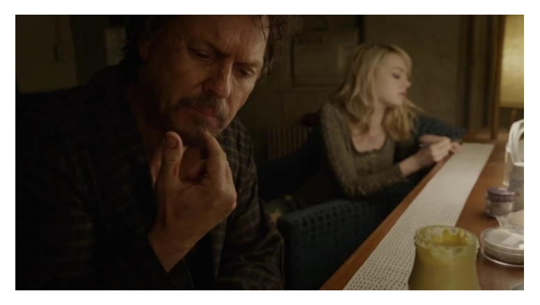
Figure 10. The Toilet paper lays out neatly on the table (01:19:08). (Iñárritu, 2014)

This conflict is resolved when Riggan apologizes to Sam for not being a good father when he says, "I was a shitty father, wasn't I?" to which Sam calmly replies, "No, you were fine." Then after that, Sam continues talking about how Riggan's play becomes viral on the internet, which suggests that Sam becomes supportive of Riggan's play (1:19:29 - 1:20:30). The resolution is visually shown in the following screenshot: