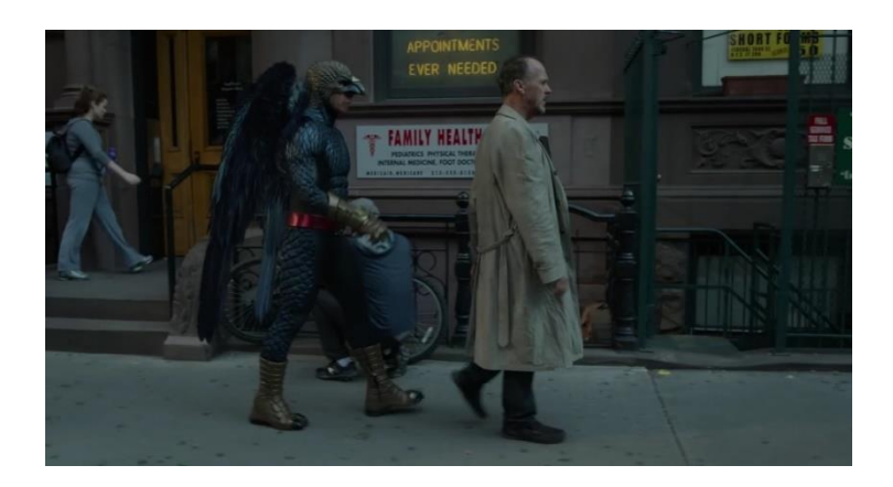
Figure 1. Wide shot of Riggan walks on the street followed by the Birdman figure (1:28:58) (Iñárritu, 2014)

The Birdman figure represents Riggan's past which is emphasized by its position behind Riggan. It is following Riggan as a hint that it affects Riggan's present self. The internal conflict is made obvious visually by splitting Riggan's character into two, himself now and himself in the past. The wide-shot type is usually used for establishing the subject's relationship to the environment and elements within it. The use of a wide shot is meant to emphasize that people around Riggan are not aware of the Birdman figure's presence, and it proves that the Birdman is only in his mind.