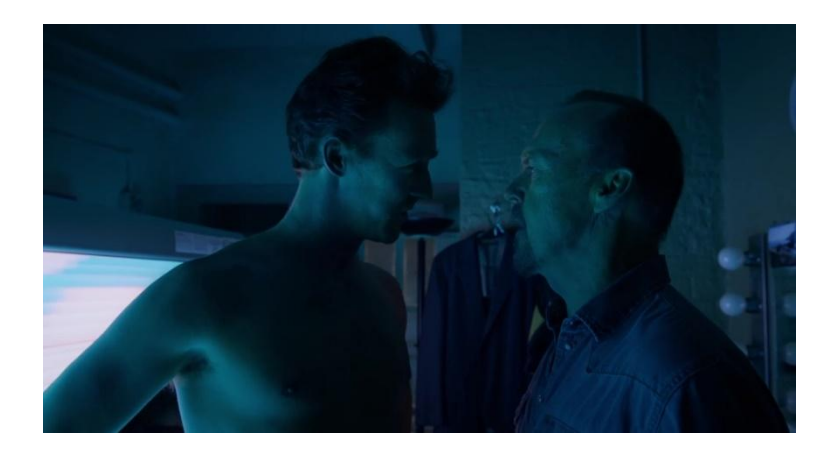
Figure 5. Two-shot of Riggan and Mike, showing Riggan's dominance by being put on the right (00:56:24). Birdman (Iñárritu, 2014)

The conflict uses the two-shot type to emphasize the two opposing ideas between Riggan and Mike. In the beginning, Riggan's position is on the right (see figure 5 above). Generally, in a two-shot the person on the right will 'seem' dominant over the person on the left. The position of the character can be interpreted as a display of Riggan's stronger dominance over Mike which is proven by what Riggan says to Mike, that it is Riggan who raises the money and arranges the press for the show. Yet, there is a dominant color of blue in figure 5 which may emphasize a dream-like quality. It can mean that Riggan's domination is just a mirage. Although Riggan shows his dominance by stating the fact that he has a full control of his play, the play will fall apart if Mike decides to go or quit. That is why later on in figure 6 the position is switched, and the blue color disappears. Mike is on the right side and is more dominant in this scene, which is proven by the dialogue he says to Riggan that Riggan should go back to be Birdman and does not deserve to be on Broadway. He also says to Riggan, "what are you gonna do? You're going to replace me?!" (00:58:21 – 00:58:23), while Riggan just walks off and does not reply anything. It shows that Riggan is powerless because he cannot fire or replace Mike with another actor.