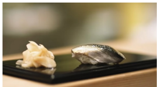
Figure 5 A Close-Up Shot of a Sushi (Gelb, 2011)

The first three shots (Figures 2 to 4) provide an important clue to the audience: the significant role of hands in producing sushi. The art of sushi-making undoubtedly requires the finesse of the hands. The gloved hand symbolizes hard work as it refers to hands that work. Figure 4 shows that the restaurant represents the ‘sushi world’ where sushi chefs produce and showcase their ‘art’ for the customers to appreciate and consume. From the element of cinematography, the film uses many close-up shots. Close-up shots give more intimacy between the object and the audience because the expressions and emotions are visible when the object is people, and they give details in texture and often raise appetite when the object is a thing such as food (see Figure 5). Close-up shots also psychologically increase viewer cognitive empathy (Lankhuizen et al., 2020). In this way, the film manages to draw the audience to feel involved in sushi production.