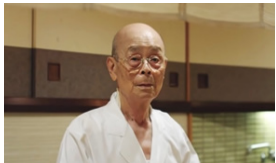
Figure 4 A Shot of a Small Sushi Restaurant (Gelb, 2011)

The first three shots (Figures 2 to 4) provide an important clue to the audience: the significant role of hands in producing sushi. The art of sushi-making undoubtedly requires the finesse of the hands. The gloved hand symbolizes hard work as it refers to hands that work. Figure 4 shows that the restaurant represents the ‘sushi world’ where sushi chefs produce and showcase their ‘art’ for the customers to appreciate and consume. From the element of cinematography, the film uses many close-up shots. Close-up shots give more intimacy between the object and the audience because the expressions and emotions are visible when the object is people, and they give details in texture and often raise appetite when the object is a thing such as food (see Figure 5). Close-up shots also psychologically increase viewer cognitive empathy (Lankhuizen et al., 2020). In this way, the film manages to draw the audience to feel involved in sushi production.