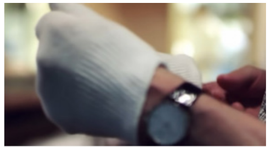
Figure 3 A Close-Up Shot of a Hand Taking off the Gloves (Gelb, 2011)