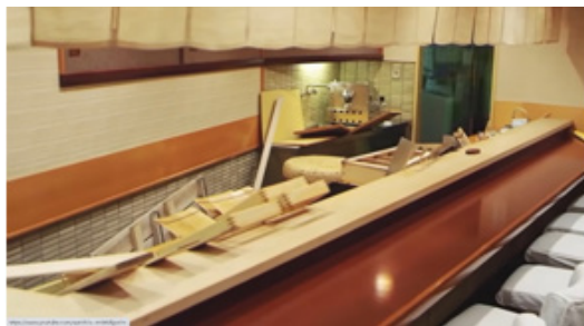
Figure 1 A Close-Up Shot of Jiro Ono, the Shokunin (Gelb, 2011)

cook of Japanese cuisine (Maurice, 2018). Dempsey (2015) has argued that the character Jiro Ono, a sushi chef, possesses traits that reflect the shokunin concept: passionate, persistent, disciplined, curious, imaginative, courageous, humble, and selfless. In other words, the sushi chef presents himself as a master, preserving the elite status of both the chef and the cuisine (Clark, 2017). In the film opening, Jiro Ono (Figure 1) expresses his life philosophy that accurately reflects a shokunin concept, “Once you decide on your occupation, you must immerse yourself in your work. You have to fall in love with your work. Never complain about your job. You must dedicate your life to mastering your skill. That is the secret of success and is the key to being regarded honorably” (Gelb, 2011). Ono’s dialogue as part of the mise-en-scène reflects the nature of a sushi chef, which includes being disciplined, passionate, and persistent. The film, through visualization, supports and emphasizes these traits to bring understanding to the audience about the concept of shokunin .