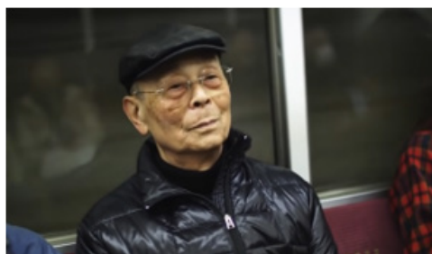
Figure 9 Jiro Ono Inside the Moving Train in the End of the Film (Gelb, 2011)

are closely intertwined and inseparable. Moreover, the meticulous and disciplined process of production is passed down to the next generation, which will ensure the quality of the food and the satisfaction of the customers. Regardless of the spreading of the sushi culture worldwide that may degrade the production quality, the strong-rooted concept of shokunin will prevail through people like Jiro Ono, who maintain the high quality of sushi production and preserve the Japanese sushi culture.