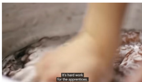
Figure 6 A Close-Up Shot of an Apprentice's Hand Massaging an Octopus (Gelb, 2011)

In another scene, the film visualizes how Ono's apprentices must massage an octopus for almost one hour (Figure 6) to ensure that it has a soft texture and to bring out the fragrance of the octopus.