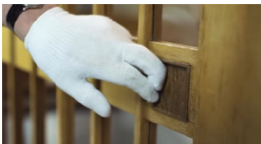
Figure 2 A Close-Up Shot of a Hand Opening a Door (Gelb, 2011)

To understand the shared meanings of the sushi culture through the concept of shokunin , it is imperative to look at the contribution of the film elements: cinematography and mise-en-scène . Visually, the film frames the consumption and production of sushi efficiently and directly through the two film elements. The film opens in a series of slow-motion shots showing a hand wearing a glove opening a door, then the shot changes into a shot of the gloves being taken off and then shifts to a shot of a small sushi restaurant (Figures 2 to 4).