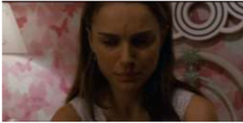
Fig.1.Nina talks to her mother about auditions (Aronofsky, 2010, 00:17:51)