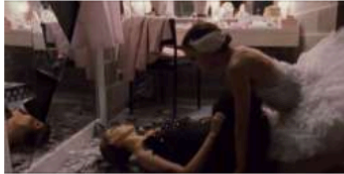
Fig.9. The two Ninas are fighting (Aronofsky, 2010, 01:33:34)

fighting with herself and stabbed herself. What happens to Nina proves that the fight and the appearance of Black Swan and Lily are just Nina's delusion. This proof can be seen in figure 9 to figure 11 below: