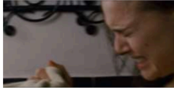
Fig.8. Nina is in pain from having cut her finger unconsciously (Aronofsky, 2010, 00:52:28)

Figure 6 shows Nina's face through a close-up shot to show Nina who focuses on trimming her fingernails. Figure 6 is juxtaposed with figure 7, showing Nina's fierce expression reflected in the mirror as she intentionally hurts her finger. Close-up shots are also used to create a parallel between two juxtaposed shots and contrast her action. Nina does not hurt her finger, and the second screenshot shows that she is delusional when she hallucinates hurting her finger. The fact that the camera captures Nina's reflection in the mirror suggests that what the audience sees is not reality. Sometimes the symbolism of the mirror is not the truth but a distortion of the truth to deceive (Chris, 2021).