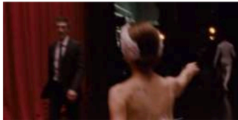
Fig.3. Thomas is angry after the curtains are closed (Aronofsky, 2010, 0c1:32:47)