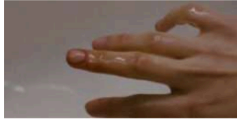
Fig.5. Nina's finger looks fine (Aronofsky, 2010, 00:32:54)

Figure 4 shows Nina's making the wound worse, while figure 5 shows that Nina's finger is fine. Both figures use close-up shots to show the details of Nina's fingers. The camera movement is a bit shaky, emphasizing Nina's panic. The shaky camera movement adds psychological effect and intensity to moments during a panic or chaotic scene (Deguzman, 2020). The two figures above show that what happens to Nina's finger is just a hallucination, indicating that Nina is delusional.