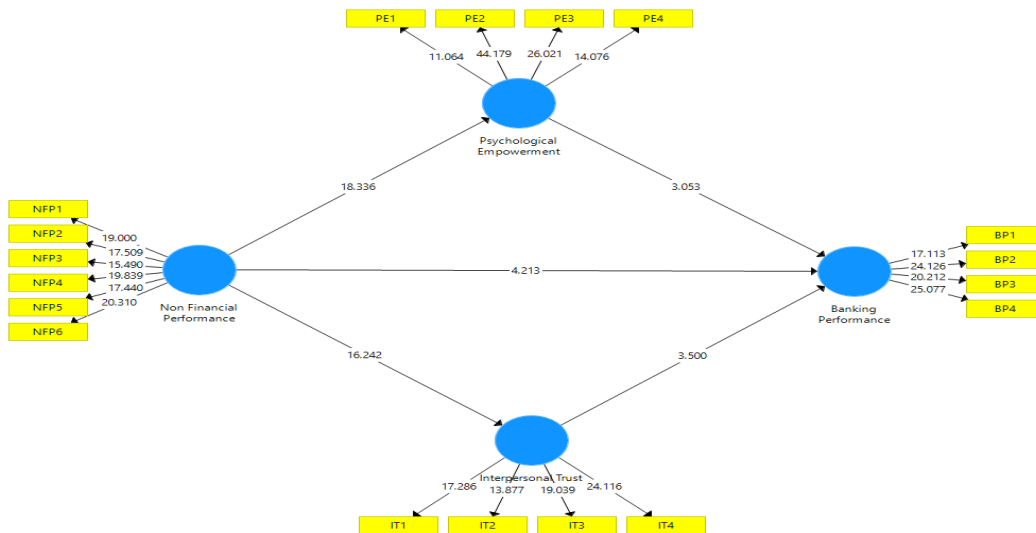
Figure 2. Output outer model

The smartPLS 3.0 tool and the Partial Least Square (PLS) analysis technique were employed in this study's hypothesis testing. The PLS software under test has the model scheme listed below (see Figure 2):