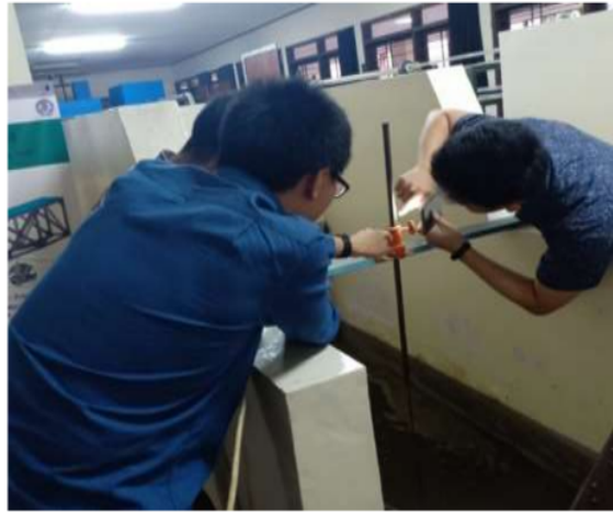
Figure 3. Manual water level measurement.