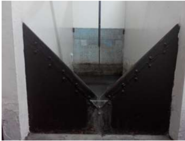
Figure 1. V-notch discharge measurement.