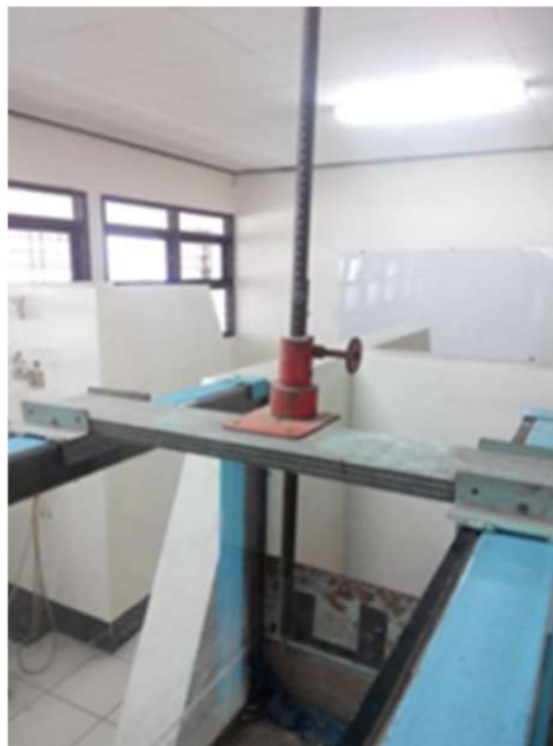
Figure 2. Water level measurement.