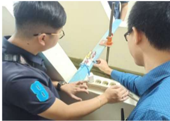
Figure 4. Digital water level measurement.