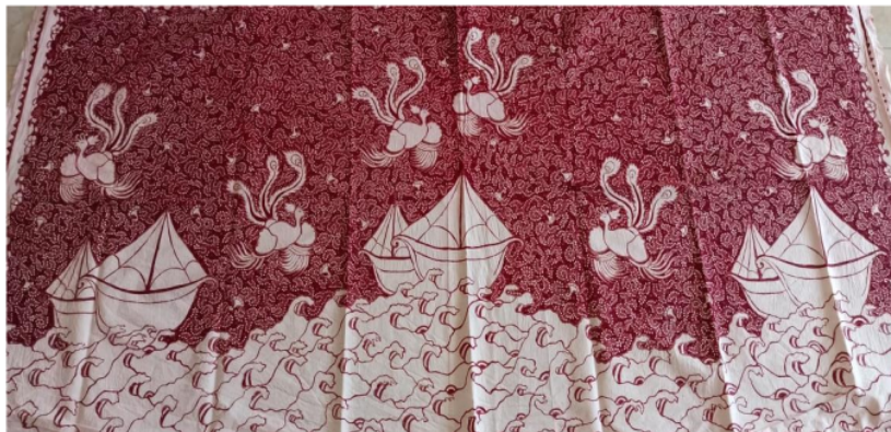
Figure 7. Implementation of the Historical and Tradition-Cultural Approach: Latohan and the Cheng-Ho Boat (Authors, 2022)

Another story on batik involving the Latohan motif can be seen in Figure 8. The art consists of diagonal lines filled with flower tendrils and Latohan strands.