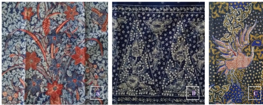
Figure 4. The Embodiment of the Third Space – Latohan Motifs in Lasem Hand Batik

The first (perceived) and second (conceived) spaces have been described, while the third space has been reported to be used as a space for interaction and creativity. The Latohan motif is produced from creativity and forms of expression. It is also obtained from the interaction between the Latoh plant and human creative ideas as the first and second spaces. Edward Soja (1996) revealed that the production of the third space comes from the successful communication between the first and second. It is also ultimately seen as a social space that transcends the two previous spaces. Furthermore, it allows the opening of new potentials that go beyond the physical and representational space and it is a place where new designs are created. One of the examples of the third (lived) space creativity is the production of various compositions of latohan motifs painted using hot wax and canting on mori cloth, which enriches Lasem Batik’s designs with their respective beauty. The creation of these arts by several craftsmen in Lasem is evidence of the existence of the Third Space, as shown in Figure 4.