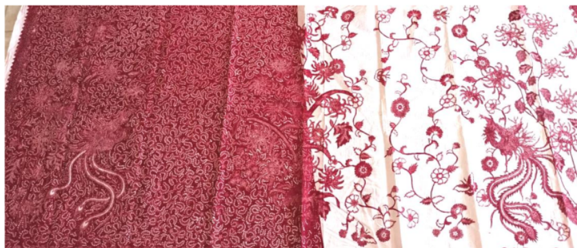
Figure 6. Implementation of the Latohan Facts and Traditions-Cultural Approach: Pagi-Sore Latohan, Krisan & Hong (Authors, 2022)

different motifs, hence, two patterns were made on one cloth. This means that one batik can be used twice and two motifs can be used in one day (Ni'mah et al. , 2021; Vina, interview 2022). The written batik in Figure 6 is called Pagi-Sore Latohan, Krisan and Hong Pagi Sore Latohan, Krisan and Fenghuang bird. The left side of the batik uses the Latohan motif, which fills the cloth as a background. The Hong bird on the left side faces the right and it is decorated with krisan flowers. Meanwhile, small krisan spreading as a background are depicted on the right side, and on the far right, there are Hong birds facing left. The Pagi and Sore sides region are separated by a bouquet of krisan flowers, which is locally called buketan krisan .