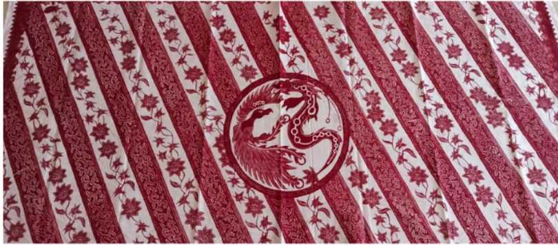
Figure 8. Implementasi Latohan Pendekatan Tradisi-Budaya: Hong Liong in Harmony (Authors, 2022)

In the center of the diagonal motif as the main elements are the Hong bird and the Dragon in a circle. Their visualization is depicted in a way, where they seem to form a Yin and Yang symbol, which is a picture of natural harmony in the philosophy of Chinese society (Dwitari, 2017). There is no good unless it is followed by bad, and there is no darkness if it is not accompanied by light, and human existence is even comprised of two sexes, male and female. The meaning of Yin-Yang dualism is also found in the Hong bird, which symbolizes the two elements of nature, namely fire and air as well as the symbol of the upper world. Meanwhile, the dragon represents the other two elements of nature, namely water, and earth as well as a symbol of the underworld. This interpretation is in line with the beliefs held by the Chinese and Javanese communities, which involve the Lasem people. To unravel the meaning of dualism, the Latohan motif is juxtaposed with Lasem's identity. This can be seen from the basic character of Latoh who brings dynamics into its environment with positive benefits and then represents the presence of a third space.