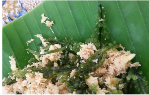
Figure 2. Lasem Traditional Food – Urap Latoh (Authors, 2018)

Based on the facts about Latoh , its elastic shape, and character can be created or described into dynamic forms to produce more varied and beautiful curves. Its beauty also becomes more meaningful when people know that it is “friendly” as well as useful. This gives Latoh plants an important role in the Lasem culture, apart from its benefit as a food source. Through the Third Space theory, Latoh is part of the perceived or first space because it has the appropriate category, namely physical. Therefore, it is a space that can be directly seen through the senses and can be observed for growth. It can also provide life through food as well as facilitate the sustainability of arts and culture, especially in Lasem. This is in line with Lefebvre (1991) that perceived space is local, and can be observed, analyzed, and occurs repeatedly. When viewed from the architectural analysis, these recurring events are related to the daily activities carried out by individuals in certain buildings or areas. Activities that occur consistently and are the same indirectly give character and habits. Meskell-Brocken (2020) makes it clear that perceived term is a process of producing material forms that are the result of daily activities and behavior, which later leads to a social-spatial perspective (Meskell-Brocken, 2020). Social space is formed when there is interaction with a wider scope. For example, involving the wider community, namely the Lasem community.