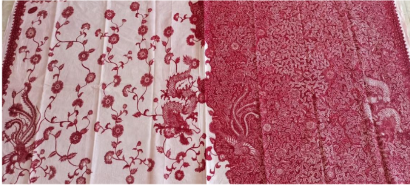
Figure 9. Implementation of the Latohan Tradition-Cultural Approach: Dragon, Hong and Latohan (Authors, 2022)

interacting with other motifs. The plant also has a history, cultural relationship and social tradition with many individuals hence, it has a deep meaning and identity.