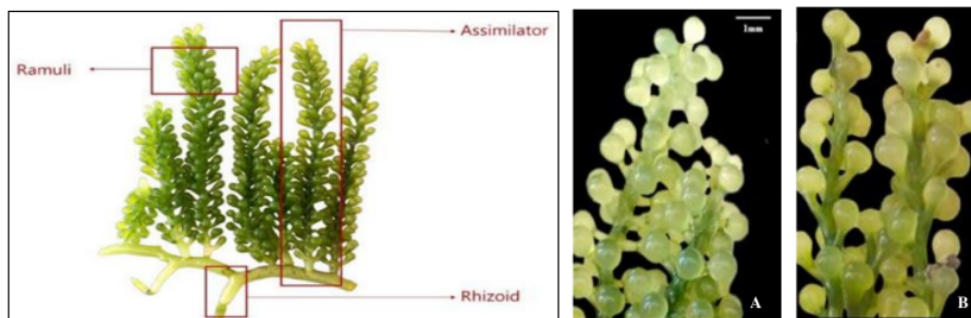
Figure 1. Latoh Plant Anatomy and Forms of Caulerpa lentillifera (A) & Caulerpa Racemosa (B) (Estrada, 2020)

According to Syamsurijal (2015) on the website of the Ministry of Maritime Affairs and Fisheries of the Republic of Indonesia, Latoh is a type of seaweed that lives attached to the bottom of shallow waters. This was supported by interviews with people in Lasem who revealed that it is usually found attached to the edge of coral reefs on the beaches of Lasem. However, it is frequently observed growing on sandy bottoms in the intertidal zone. Latoh can be found in coral reefs with a depth of up to 200 meters. The plant lives attached to the bottom substrate of marine waters, such as dead coral, coral fragments, sand, and mud. The growth is epiphytic or saprophytic and it is sometimes associated with other marine plants (Atmadja et al. , 1996). This shows that Latoh is a friendly plant because it can coexist without harming its host. Furthermore, it lives by obtaining nutrients from dead organic matter, which indicates that it is beneficial to the ecosystem. It can also convert these dead materials into energy, thereby recycling nutrients in the environment.