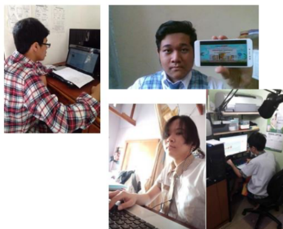
Fig. 5. Online Bebras Challenge for junior and senior high school.

Table 2 shows information about contest participants' distribution in the Maranatha Bebras Bureau. Total participants were 1,740, with 190 students in junior elementary school (11%), 338 students in senior elementary school (19%), 918 students in junior high school (53%), and 294 students in senior high school (17%). The order from the most to the least number of participants were junior high school, elementary school, and senior high school. Based on gender, male participants were 52 % and female participants were 48 %. Elementary school participants were from 24 schools, where 13 schools have followed the Bebras Challenge from the previous year, and 11 new schools. Junior high school participants were from 18 schools, with 3 new schools, while senior high schools from 19 schools with 6 new schools.