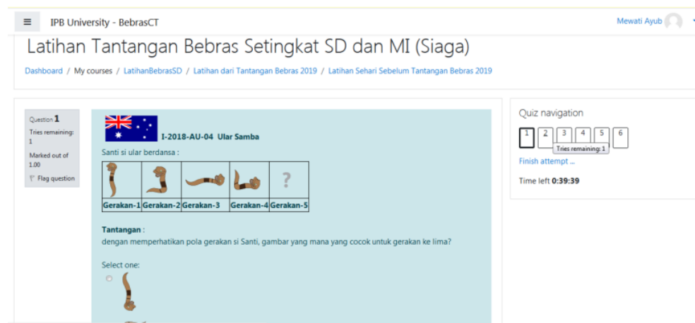
Fig. 1. Bebras task example accessed through site of IPB.

A Bebras task consists of a description and an interesting picture as a stimulus, that should be answered in three minutes. The answer can be a multiple choice, a short answer, or interactivity answer using drag and drop. In Indonesia, Bebras tasks are available in discussion books which can be downloaded from the official site of Bebras Indonesia (link https://bebras.or.id/v3/pembahasan-soal/ ). The tasks can also be accessed online at the link https://latihanbebras.ipb.ac.id/ , that is a site to practice Bebras tasks at IPB server. The Bebras task example is shown in Figure 1. The lecturers should be ready to discuss with the teachers, if there are tasks which need some explanations of the solutions.