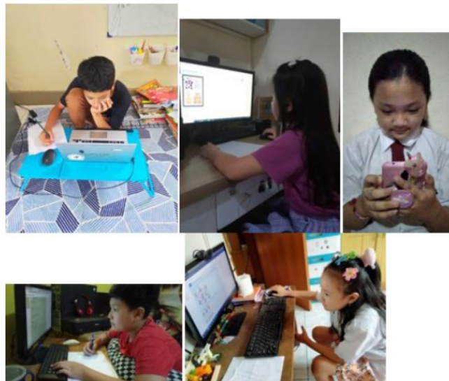
Fig. 4. Online Bebras Challenge for elementary school

In addition to limitation of telecommunication infrastructures in Indonesia or tools used by the participants, Bebras Indonesia opened exceptions reporting at the time of the contest. The exceptions may be power outages or internet disturbance. In exceptional cases, students or parents (for elementary school) could report to the teacher. The teacher delivered the report to the mentor. The mentor sent the report to the coordinator. The coordinator reported the cases to Bebras Indonesia. The communication was done through chats via WhatsApp group, calls, or emails. The participants, which encountered the exception were recorded. On 13 November 2020, after the challenge was finished, the contest committee evaluated the cases and decided the way out. The committee gave an opportunity to the participants of the cases to redo the contest in certain schedules.