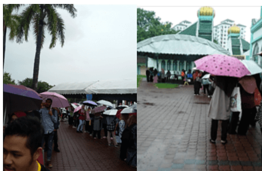
Fig. 1. Queuing Activity in Front of Masjid Al-Malik Khalid during Ramadan