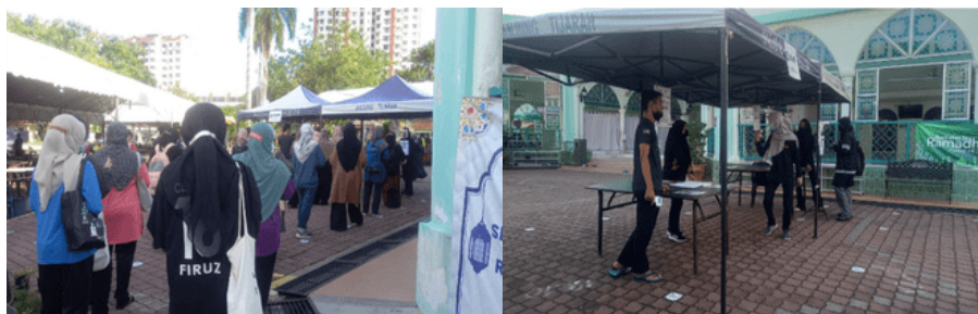
Fig. 3. Queuing with Distance & Scanning Area at Masjid Al-Malik Khalid during Ramadan 2021

After almost a year, the pandemic situation has been improving. The vaccine process has begun, and the Movement Control Order (MCO) has changed to a lighter regulation, namely the Perintah Kawalan Pergerakan Pemulihan (PKPP) or Conditional Movement Control Order (CMCO). In this phase, social activities are permitted but with particular operating standards. Iftar activities and taraweeh prayers are allowed with the mandatory wearing of a mask, maintaining a distance of at least one meter, scanning the barcode, and checking body temperature when entering the area ( https://covid-19.moh.gov.my ). Based on these conditions, the USM campus implemented the rules. The campus residents could again treat their longing for the Masjid Al-Malik Khalid and its activities. Queuing for iftar foods again occurs, but without the “typical crowd”. In that moment, the sense of place has slightly changed. The last year’s “crowd” sounds and feeling are not fully present, probably will never come back. The concept of the activity is the same but provides a different experience. The pandemic covid 19 has change all sense (figure 3).