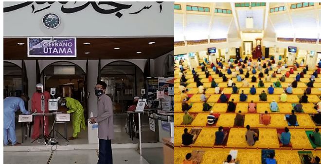
Fig. 5. Eid-ul Fitr Prayer with Distance at Masjid Al-Malik Khalid during Ramadan 2021