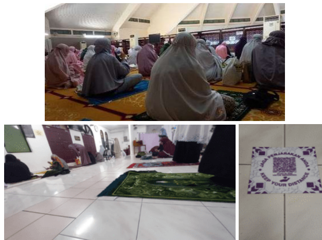
Fig. 4. Taraweeh Prayer with Distance in the upper floor (above) & at Anjung (bellow) Masjid Al-Malik Khalid during Ramadan 2021

Circumstances have influenced the behavior, experiences, and senses of everyone who experiences them, both indoors and outdoors. In this case, the behavior transformation is due to the pandemic shown in Figures 4 and 5. However, that is the key to the sustainability of the masjid's sense of place. Masjid Al-Malik Khalid as architecture does not only provide the experience of the sense of sight, but also the other senses. The statement is in line with Pallasmaa (1996) that activities around architecture can produce strong attachments to the place. Because architecture is the art of reconciliation between ourselves and the world around us, and mediation occurs through the senses [21]. There is an urgency and a challenge to adapt to a pandemic like the current situation. The situation indirectly built acceptance for another placemaking, and develop a different sense, which was influenced by previous memory.