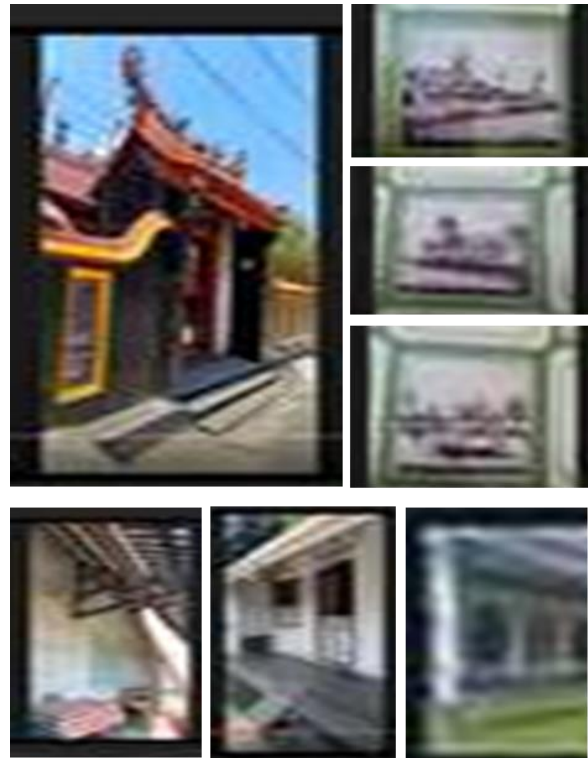
Figure 4. Chinese (left above) and European (right above) Cultural Details in Temple & Cultural Details in Peranakan Houses of Jamblang (bellow)

Virtual tours can also convey the atmosphere of the Pecinan Jamblang to the audience, although they come from different places and times. Pallasmaa supports this statement, and he describes the atmosphere as the character of the built environment that is most quickly and widely felt and that causes the experience [11].