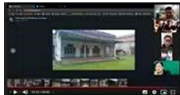
Figure 2. Picture from Google Map and Other Documentation as a Support Sources in Virtual Tour.

Figure 2 present the other sources apart from the live broadcast from google Maps images and pre-existing documentation. This can expand the range of spatial audience experiences that are less clear from live