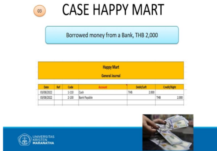
Fig. 4. Recording of Accounting Transaction

The following is an example of accounting records and the form of financial reports recorded in the Excel application: