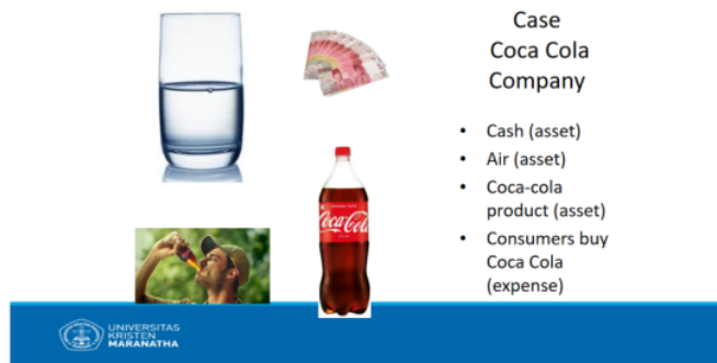
Fig. 2. Example of Accounting Concept Cases

Figure 1 and Figure 2 are simple explanations of the basic concepts of accounting for MSMEs that will be conveyed by the team to the people of Thailand. This simple explanation is expected to make it easier for MSME owners to record MSME activities that occur.