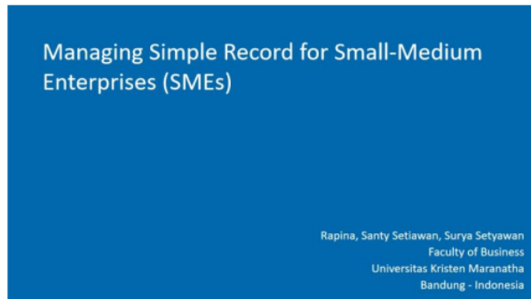
Fig. 6. Presentation of MSMEs Financial Statements

The following is an example of a power point that has been prepared to be delivered directly to the people of Thailand: