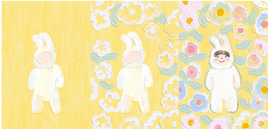
Figure 2 The initial work process to create a work entitled "Among the Flower", 100x120cm, acrylic on canvas, 2021

Then in the next stage is to consider materials and media that can be used to explore new forms. One that the artist uses is acrylic paste medium. This material adds texture to the painting and produces an embossed effect that gives depth to the painting. The next step is to sketch the figure on the canvas. Then exploration is carried out in mixing colours according to the desired concept. The final step is to provide details that can occur spontaneously with bare hands or using the brush in the creation of the work.