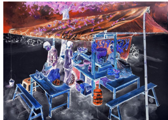
Virtual Ketoprak Food Stall When COVID-19 News Spreading

The next art work is the work of Martinus Dwi Marianto, an Indonesian artist who is creative and innovative in taking themes of COVID-19 pandemic. His work seeks to display hidden messages and impressions by visualizing a ketoprak (traditional food) stall/ stand that is open during the COVID-19 pandemic. His work provides a visualization of the dark ambience of the stall, covered in a dark aura, describing the condition of the Ketoprak stall that is uncomfortable, tense, and scary for both buyers and sellers. Although it seems gloomy, the aesthetic value of his work looks bold.