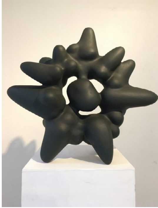
The Mind Sees Fertility 36x87x76cm Fiberglass 2021