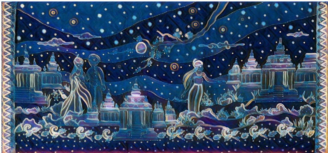
Roro Jonggrang Serial

Computer Reversed Image of a Watercolor Painting 2020