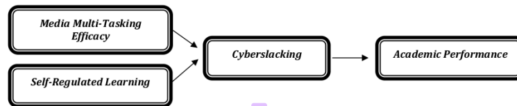
Figure 1: Research Model

Several preliminary studies have shown that the negative impact of using the internet in the classroom is not related to non-academic activities on student performance. An example is a research carried out by Barks et al. (2011) on students at midwestern universities. According to Barks, students that used their gadgets for text messaging during the learning process showed poor academic performance scores. This is in line with the research carried out by Clayson and Haley (2013) on marketing students at two different campuses. Experimental studies carried out by Hembrooke and Gay (2003) has also provided evidence that cyberslacking behavior in the learning process plays an impact on decreasing student academic performance. Meanwhile, Ravizza et al. (2014) stated that cyberslacking is related to student performance. The research carried out by Le Roux and Parry (2017), with data obtained from 1678 students from 10 different faculties at a university in South Africa, found that courses influenced the relationship between these behaviors and academic performance. Setiawan's research (2019) found insignificant results between cyberslacking and the academic performance of accounting students in Yogyakarta, Indonesia. The previous research showed that there are still inconsistencies between cyberslacking and academic performance.