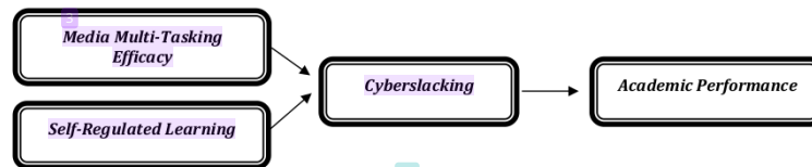
Figure 1: Research Model

Several preliminary studies have shown that the negative impact of using the internet in the classroom is not related to non-academic activities on student performance. An example is a research carried out by Barks et al. (2011) on students at midwestern universities. According to Barks, students that used their gadgets for text messaging during the learning process showed poor academic performance scores. This is in line with the research carried out by Clayson and Haley (2013) on marketing students at two different campuses. Experimental studies carried out by Hembrooke and Gay (2003) has also provided evidence that cyberslacking behavior in the learning process plays an impact on decreasing student academic performance. Meanwhile, Ravizza et al. (2014) stated that cyberslacking is related to student performance. The research carried out by Le Roux and Parry (2017), with data obtained from 1678 students from 10 different faculties at a university in South Africa, found that courses influenced the relationship between these behaviors and academic performance. Setiawan's research (2019) found insignificant results between cyberslacking and the academic performance of accounting students in Yogyakarta, Indonesia. The previous research showed that there are still inconsistencies between cyberslacking and academic performance.