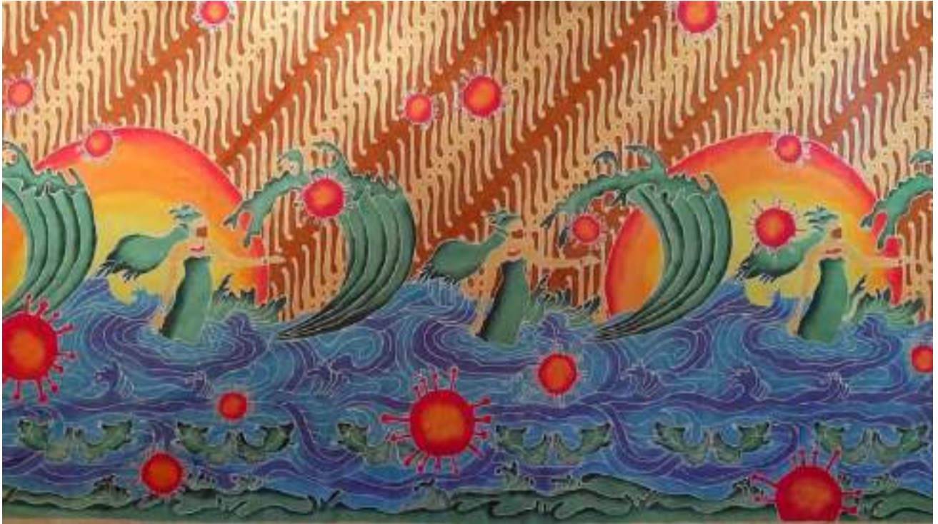
Nyi Roro Kidul In Pandemic Period 210 x 110 cm 2020