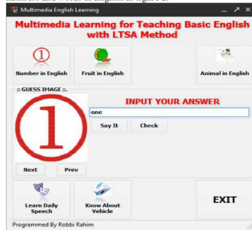
Fig.2: Learning Number

Figure 1 is a prototype of the application created, in Figure 1 there are several buttons for accessing Basic English learning, for example is Number in English which is used to display the image of numbers and words in English as figure 2.