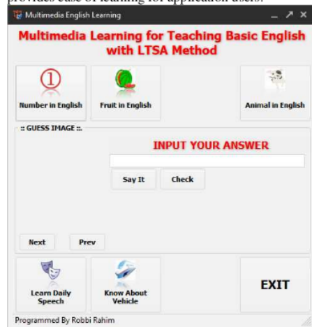
Fig.1: Main Form

Prototype application created using Borland Delphi programming language, Absolute Database as Database, and Text To Speech provides ease of learning for application users.