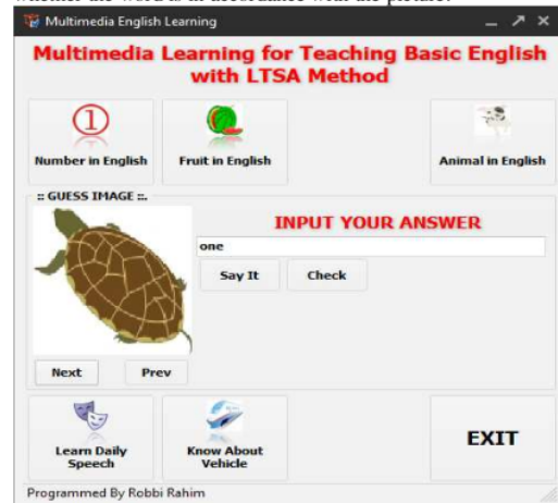
Fig.3: Animal in English

Figure 2 is a view of knowing the word in English and there is Say It facility to pronounce the word in English and check to check whether the word is in accordance with the picture.