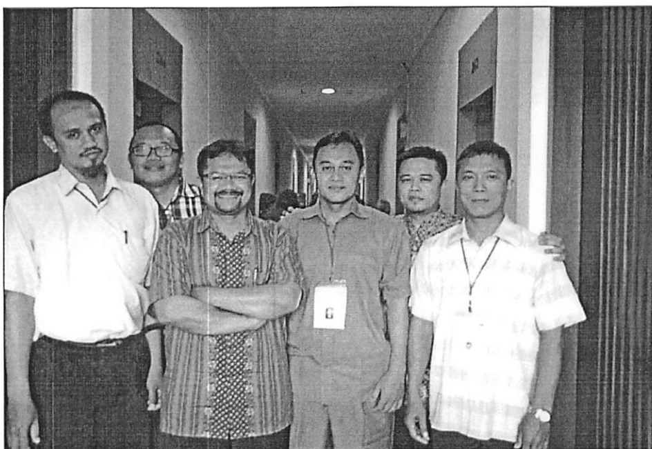
The Teachers of Indonesia

Negative labeling towards teachers result in representation and interpretation that put teachers as victims of violence. Positive labeling on teachers can be established if only teachers are willing to approach the students personally and spiritually. Negative labeling on teachers can actually be removed if only teachers expand their knowledge and proficiency to be more valuable.