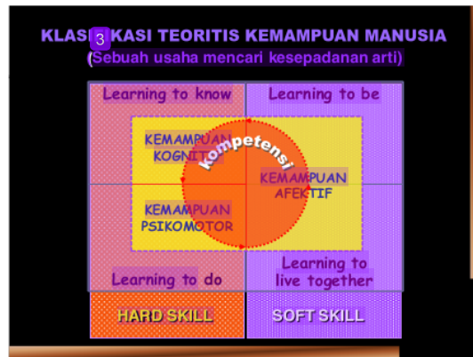
Fig 1. The learning process

In the practice of learning, learning resources must be developed in the presence of the above pillars and make the paradigm a lifestyle (life skill). The learning process will run optimally if we succeed in building skills known as cognitive ability, affective ability, and psychomotor ability. As seen from this scheme.