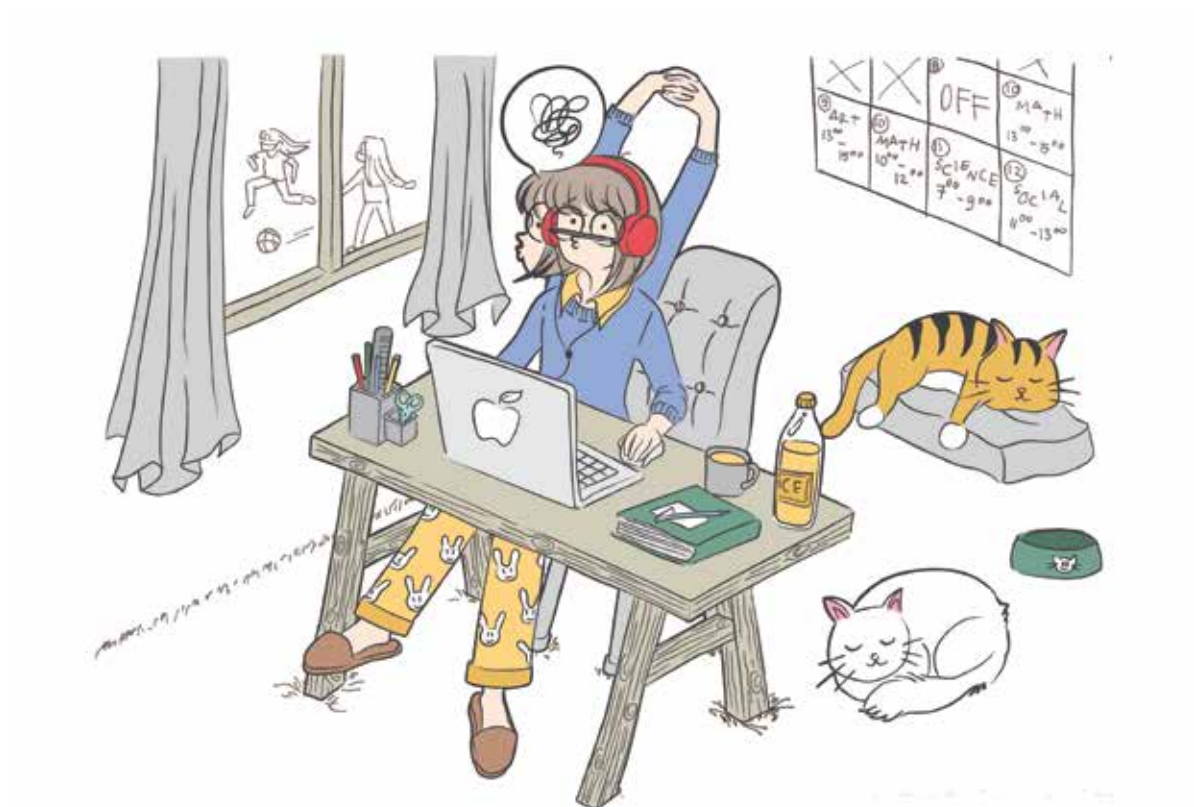
Dewi Isma Aryani "Can't Wait to Play" Indonesia