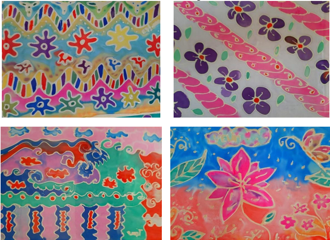
Figure 6: Sample of the work from participants

The success in this training can be seen from the work of the participants who made batik for the first time without canting, their expertise in making motifs because they were used to making motifs using canting. It takes time to get used to making batik without canting so that the hands are flexible. The colors used in this training are brighter, the dyes used are self-made concoctions. Objects created spontaneously, expressively, and freely. The result is a variety of objects from the combination of flora motifs with zigzag lines, floral motifs made such as slope batik motifs, free motifs, and a combination of flora and fauna motifs, motifs that represent flowers and butterflies.