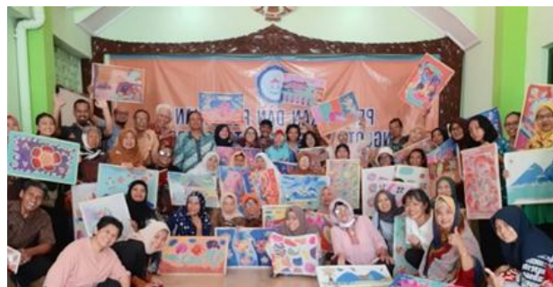
Figure 5: Training Finished Resource: Team. 2020