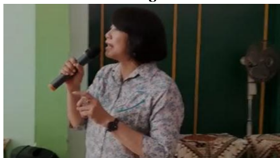
Figure 2: Socialization and transfer of knowledge to participants. Resource: Team. 2020

One of Indonesia's natural potentials is the Tamarind tree which is widely available in Java (Pandanwangi et al., 2020). Tamarind ( Tamarindus indica ) contains alpha hydroxy acid (AHA), which is known for its exfoliating properties (Anwar Siswadi, 2018). Tamarind seeds contain lots of protein, carbohydrates and fibre, as well as high mineral content. The ability of tamarind seeds as a bio coagulant is due to their high protein content which can act as a natural polyelectrolyte (Putri, 2017).