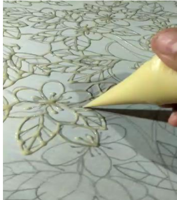
Figure 3: Making batik without canting, after drying it so that the cold wax traces dry out

For most people, making batik without canting might still feel foreign, as did many participants in this activity. Question after question, including the purchase of materials, became the participant's curiosity. When demoed how to use cold candles, the initial comments were very easy, safe, fun. Use it gripped and pressed at the end until the cold wax liquid comes out of the plastic triangle tip (Pandanwangi et al., 2019).