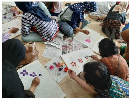
Figure 4: the staining process using the dabbing technique after ironing, washing and drying