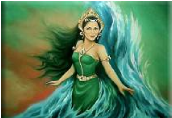
Fig.4: Nyai Roro Kidul Painting (down)

shapes the human mindset [12] (Afif 2010). Barthes believes that all objects can become myths, if they contain a message. Myth is not determined by the material, but the message conveyed. Myths are not always verbal, so there are myths in films, paintings, sculptures, photography, advertisements, comics and others [13] (Barthes 1972). Furthermore, Barthes analysis that myth is a special system built from a pre-existing sociological chain.