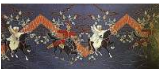
Fig. 5: Obtained Data: Pangeran Diponegoro

Currently, most of the development of batik motifs, especially the art of batik painting, which refers mainly to traditional decorations, the re-