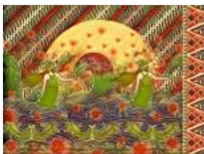
Figure 8: Digital Nyai Roro Kidul

Batik with a narrative style offers a mystical nuance to Indonesian myths through various reinterpretations of the story of Nyai Roro Kidul as the queen of the rulers of the southern coast of Java. These motifs are combined with decorative patterns inspired by the flora and fauna of marine life. The purpose of repositioning the Nyai Roro Kidul myth is to explore coastal features as well as to revive the myth and legend narrative of Nyai Roro Kidul, Queen of the South Coast of Java Island