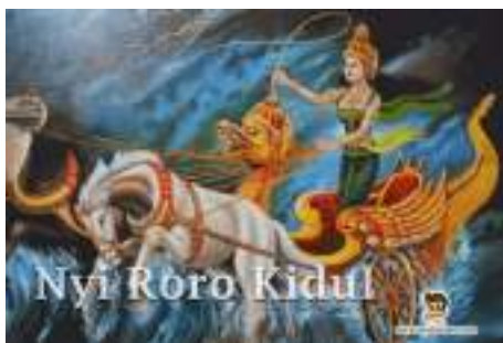
Fig. 1: Cover Book Story Nyai Roro Kidul

This study is an idea in the process of making batik telling. The visual study data comes from the storybook cover (figure 1), Movies on Youtube