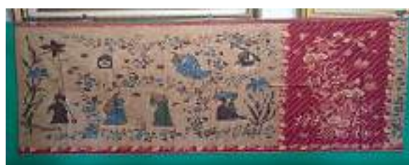
Figure 6: Obtained Data: Cinderella