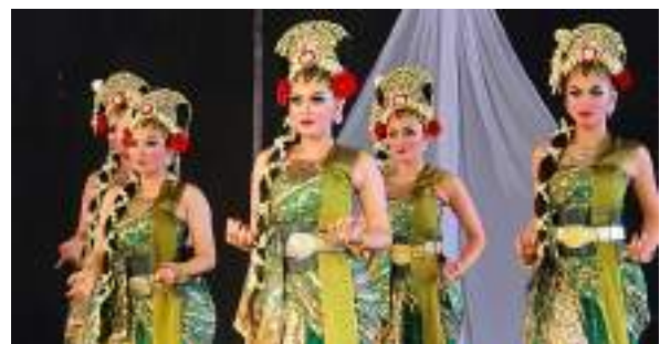
Fig. 3: Nyai Roro Kidul Dance

Another Indonesian myth that is well known in the beliefs of people on the island of Java is Nyai Roro Kidul, who is believed to be the mythical figure of the ruler of the South Sea (South), there are many other myths and legends in Indonesia. Rodriguez, an expert who has analyzed some of the aims of myths, legends and fairy tales in cultural development, said that: fairy tales are not only considered the best supervisors of language and cultural heritage, but also great helpers in the socialization process, they teach children knowledge which is sometimes difficult, about how to interact with others, and what happens when good meets evil [11] (Samovar 2010). Belief in myths