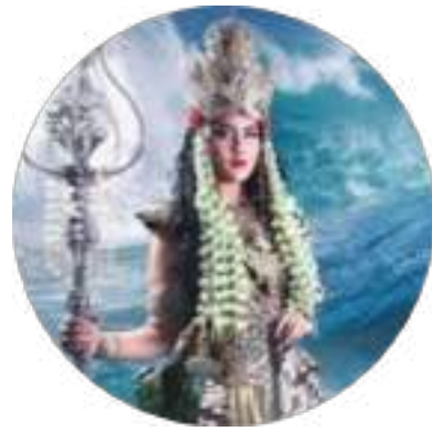
Fig. 2. Movies on Youtube - Nyai Roro Kidul

(figure 2), Nyai Roro Kidul Dance (figure 3), Nyai Roro Kidul Painting (figure 4).