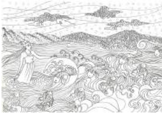
Figure 7: Sketch Nyai Roro Kidul