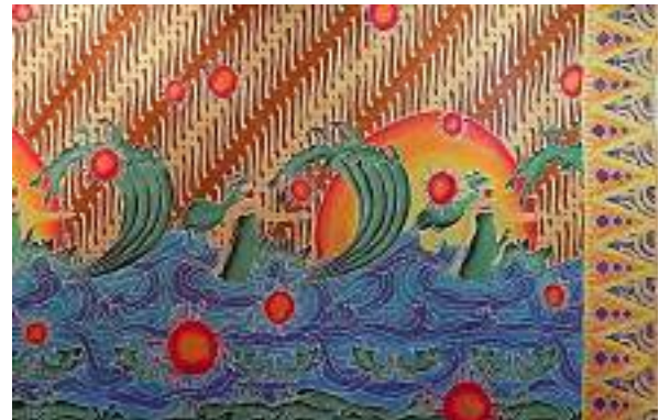
Figure 9: Batik which telling Nyi Roro Kidul using mask on silk baron. 210 x 110 cm

sults tend to appear monotonous. It needs a visual refresh and a diversification of ideas to produce a new, unique, creative, and innovative style of modern batik painting.