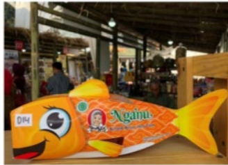
Figure 4 One of the contestants presented a unique traditional packaging using the Mega Mendung batik motif for the scales of the fish (a traditional icon).