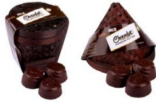
Figure 3 Chocodot chocolate's unique packaging.