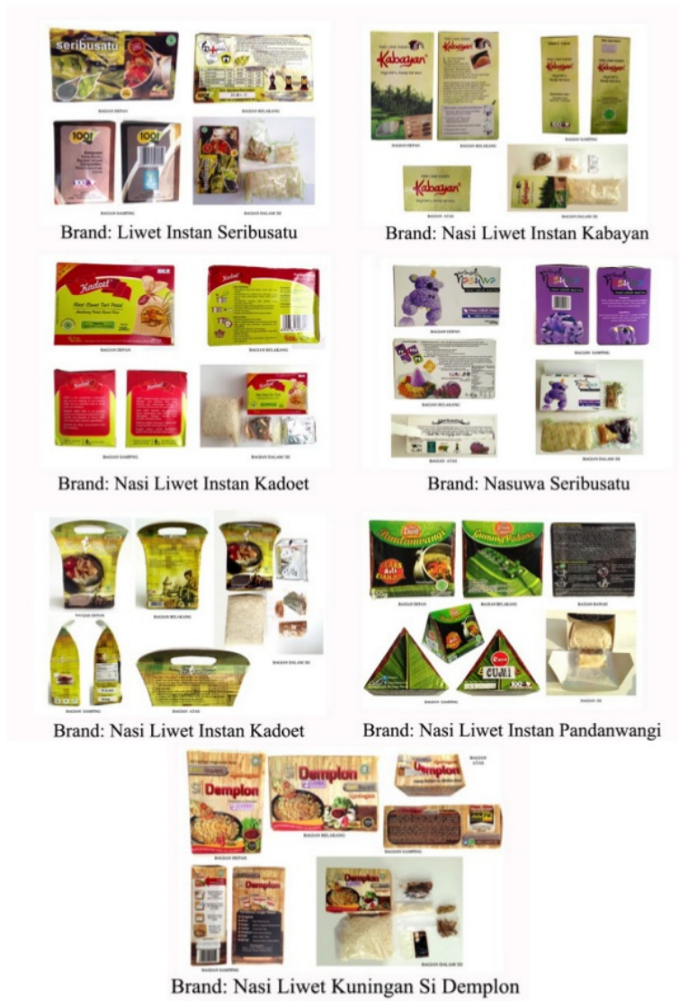
Figure 1 The seven samples that were used as the objects of study.