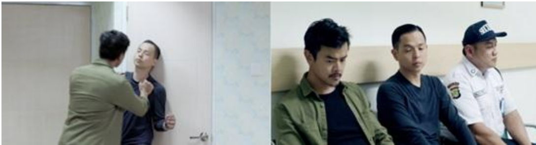
Figure 8: The scene of the younger brother apologized to his brother, after they quarrel.