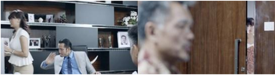
Figure 11: The scene of Koh Afuk admonishes inappropriate treatment of employees by her boss.

In this doctrine, Confucius teaches that a leader must be wise to his employees not allowed to be authoritarian, and employees should provide useful ideas to his boss for the common good. This can be seen from Confucian words "A king treats his ministers with Li (courtesy or full of good manners). A minister serves the king with Zhong (loyalty)"