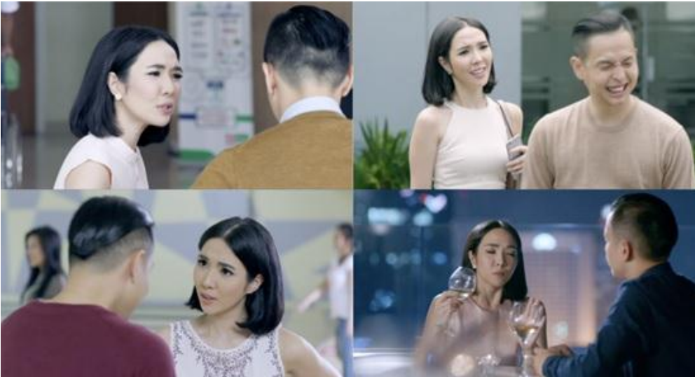
Figure 3: The scene of Natalie is Erwin's future wife that is selfish.