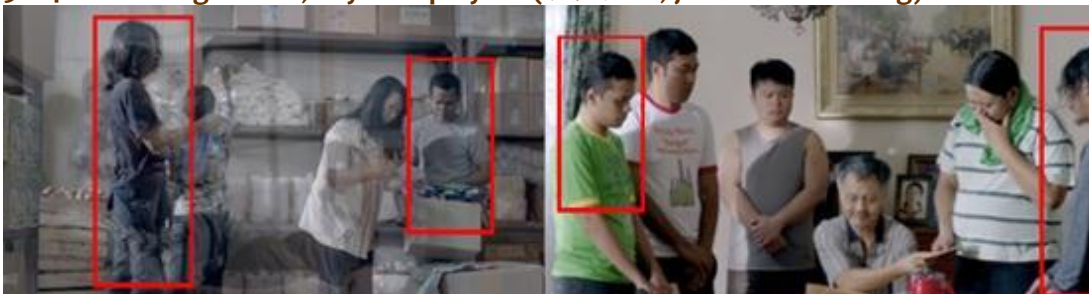
Figure 10: The scene of wise treatment of employees by boss and the loyal employees.