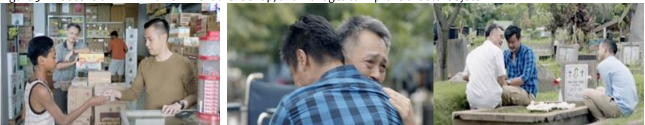
Figure 6: The scene of Father taught Erwin to serve customers. Figure 7: The scene of Father was not ashamed to apologize to his son.

Confucius taught that a father should guide their children and children should show respect as well as the results of his father's tutelage. In serving the parents, children should be warned but gently. If the parents do not obey, be more respect and do not violate. Although it should be bercapai tired , do not grumble. Parents should be prioritized as devotion in the family. A loving father in educating his sons and daughters will produce a devoted child to his parents.