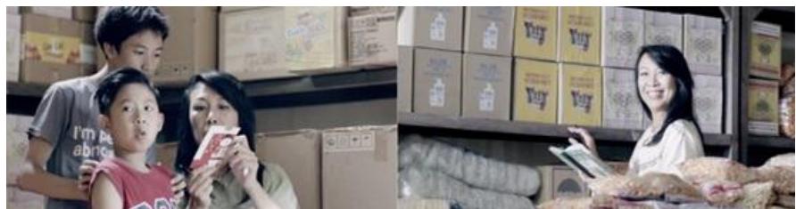
Figure 1: The scene of “Koh” Afuk's loyal wife, dedicating his life to the family.