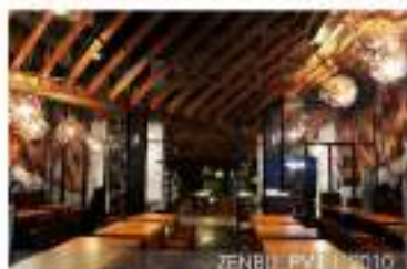
ZENBU PVI | 2010