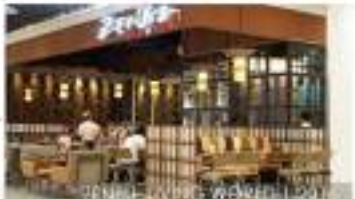
ZENBU WING WORLD | 2015