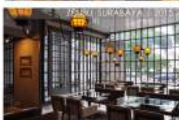
ZENBU SURABAYA | 2015