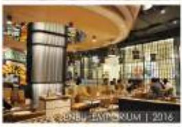
ZENBU EMPORIUM | 2016