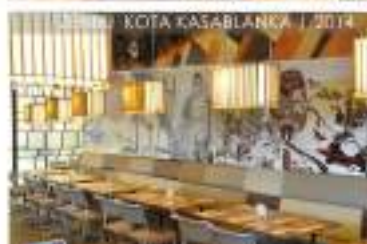
ZENBU KOTA KASABLANKA | 2014