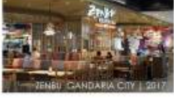
ZENBU GANDARIA CITY | 2017

ANGNGA STUDIO F & B SERIES : ZENBU HOUSE OF MOZARU