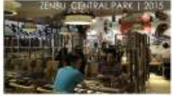
ZENBU CENTRAL PARK | 2015