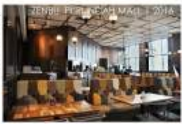
ZENBU PLAZA NEAR MALL | 2014