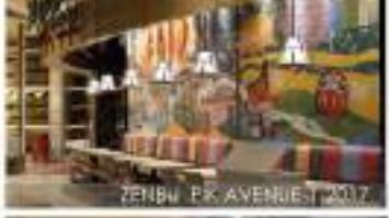
ZENBU PK AVENUE | 2017