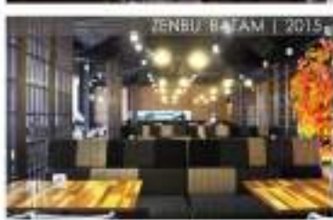
ZENBU BATAM | 2015