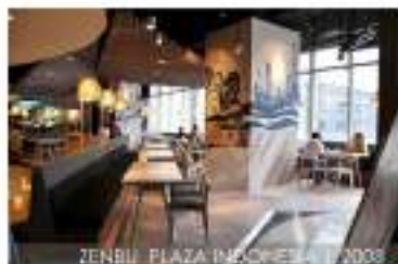
ZENBU PLAZA INDONESIA | 2009