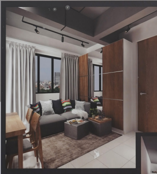
Yuma Chandratera OSWALD STUDIO

This house is designed using multifunctional furniture, which is easy to slide, open and close to facilitate the user so that it is more efficient, practical as well as saving space.