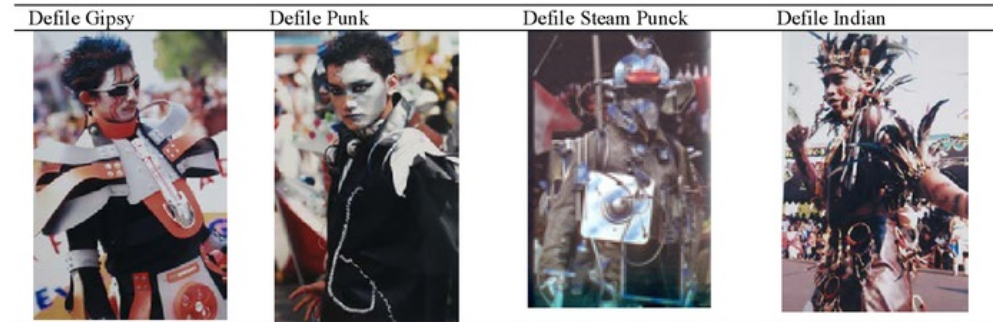
Table 2. JFC costume visualizations in 2003