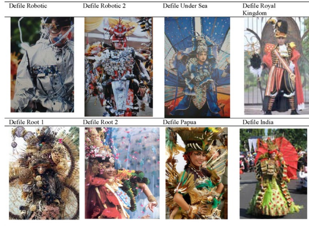
Table 3. JFC costume visualizations in 2008