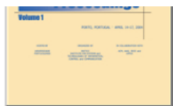
Proceedings of the Sixth International Conference on Enterprise Information Systems