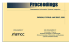
Proceedings of the Eighth International Conference on Enterprise Information Systems