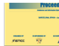
Proceedings of the Tenth International Conference on Enterprise Information Systems