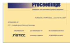
Proceedings of the Ninth International Conference on Enterprise Information Systems