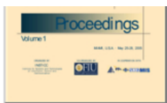
Proceedings of the Seventh International Conference on Enterprise Information Systems