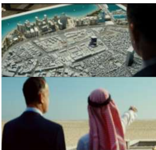
Figure 5: The dream vs the reality

and the vast emptiness of the desert where the city will be built (see figure 5 right). This “wishful thinking” is then negated by one of the salespersons who admits that no one yet makes any commitment to purchase any condo unit. In addition, their attempt to draw prospective buyer by placing a “fake” coming soon ads of a Western fast food restaurant chain such as KFC and Starbucks is another interplay between the promising mirage they try to create and the reality they face.