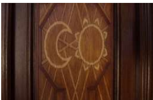
Figure 8: The sun and the moon

The film ends with the shot of the front door of Zahra's house that has a carving of the moon and the sun (see figure 8). The two entities represent two aspects that can never be together, yet they are there side by side, which suggests a reconciliation between two cultures that is actualized by Clay and Zahra's relationship. This final shot also cleverly displays the interplay between mirage/reality by placing them side by side.