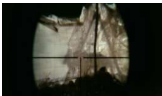
Figure 1: The wolf

The turning point of Clay’s life that makes him decide to further his relationship with Zahra is during wolf hunting in the desert. In that scene, the audience do not actually see the wolf but its shadow behind some hanging clothes (see figure 1). The shot in figure 1 is a clear example of how the interplay between mirage and reality is shown. It represents a mirage because no one can tell for sure what animal lurks behind the screen, and no one can predict what it will do. We learn that the wolf seems hesitant when it is so close to the sheep, and eventually it goes away. I argue that at that critical moment for the wolf, Clay sees himself as the wolf who merely attempts to survive in the bizzare, incomprehensible situation. When he decides not to shoot the wolf, he is actually giving a chance not only for the wolf to survive, but most importantly for himself. From that moment on, Clay becomes more determined to survive or revive, in his case by making a move toward Zahra.