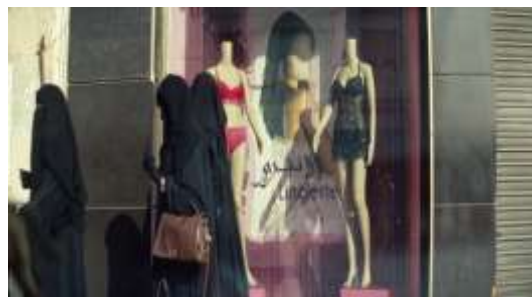
Figure 6: the conservative-clad women vs the modern lingerie

modern secular and the conservative Islam.