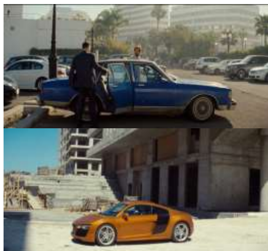
Figure 4: contrast setting and props

Figure 4 above shows playful shots that emphasize the interplay between "mirage/reality". Yousef's car in the left shot is contrasted against the expensive cars and the towering buildings. In the right shot, Kareem's sports car seems to be out of place when it is placed in the center of an unfinished empty condos. The empty building fittingly represents the mirage: the wishful thinking of the developer to have a magnificent city in the middle of the desert when he shows the miniature model of what the city will be like (see figure 5 left)