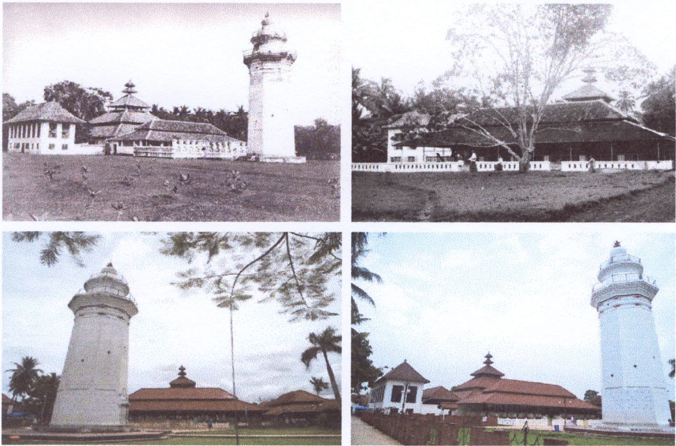
Fig. 1: The Journey of Banten Great Mosque since 1874, 1933, 2013 and 2011 (clockwise). Woodbury&Page Studio England, 1874; Private Collection, 2011, 2013; Bantenologi, 2014.

Muhammad [8]. There is a royal tomb area in the north side of Banten Great Mosque, it has mausoleum called ‘cungkub Hasanuddin.’ The cungkub have been there since Sultan Maulana Hasanuddin passed away in 1570. A philology expert from Bantenologi said that initially the area around the cungkub did not have a roof, and the floor was not covered by tiles, but the pilgrimage activity in the north tomb has been increasing everyday [8]. This probably was the reason for the renovation in the porch and in the surrounding area of the cungkub – covered by white and brown tiles; merely purposed to make the visitors comfortable. This situation can be recorded as an evidence that the first Sultan of Banten Sultanate was a very respected and charismatic person who pierced the boundaries of history, to the present.