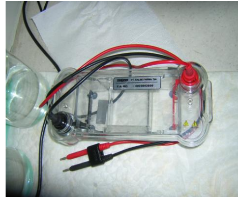
Mesin elektroforesis (BioRad)