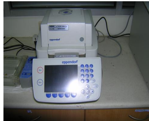
Mesin Polymerase Chain Reaction (PCR) (Eppendorf)