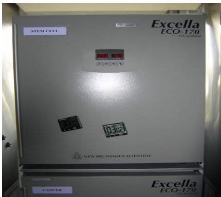
Incubator CO 2 Excella ECO 170 (New Brunswick Scientific)