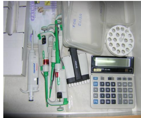
Pipet mikro (BioRad)