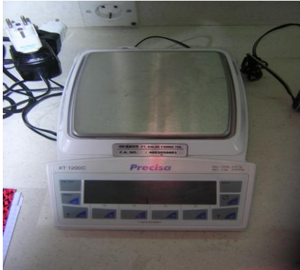
Timbangan mikro (Precisa)