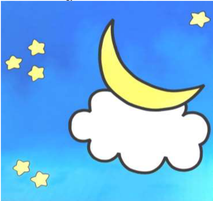
Figure 4. Night Sky

The second creation is motivated by the feelings experienced by the author when looking at the atmosphere of the night sky. In his daily life, from waking up in the morning until late at night, a person is busy with various activities, from small things to works of art that drain energy.